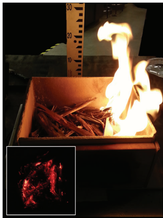
Fig. 1. Laboratory burning of masticated shrub fuelbeds. Fuelbeds were ignited along one edge utilising a flat paraffin-soaked wick (visible along the right edge of fuelbed) and flame heights ocularly estimated during burning (rule gradations are in cm). Mass loss was recorded via a bench scale interfaced with a computer. Insert: smouldering and glowing combustion followed flaming.

Fuelbeds were burned within combustion boxes (25 × 30 × 15 cm inside dimensions, Fig. 1) lined with 13-mm-thick cement