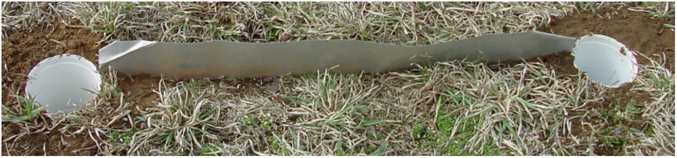
Fig. 4. Barrier pitfall trap.