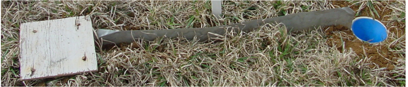
Fig. 5. Barrier pitfall trap with plywood rain cover (left) and funnel (right).