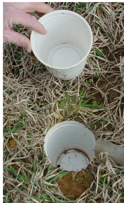
Figure 1. Removable collecting cup and permanent cup installed in ground.

A circular pitfall trap consists of a permanent 32-ounce cup sunk into the ground and a removable 16- or 32-ounce collecting cup with the same rim diameter snugly nested into the permanent cup. Nesting the cups allows easy servicing and results in far less ground disturbance.