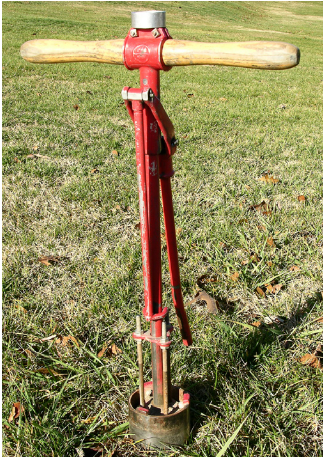
Figure 2. Golf-cup cutter.

Dig a hole as deep as the permanent cup is high. In softer soils, a golf-cup cutter and hand trowel work well to cut the holes. In harder soils, a posthole digger and digging bar might be needed.