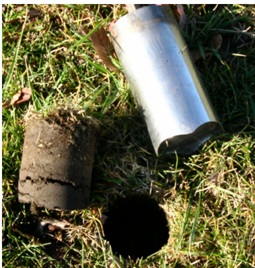
Figure 3. Cutter blade and plug just removed from turf.

Use cups with rim diameters that are the same or slightly less than the diameter of the golf-cup cutter, about 4.25 inches (110 mm). Poke drainage holes in the bottom of the permanent cup, then install it in the hole, packing soil around it. The rim of this cup should be just below the soil surface. Place a collection cup inside the permanent cup, and pack the soil so that its rim is flush with the soil surface and there are no gaps between the rim and the soil. Spread debris so that the area around the pitfall trap matches the surrounding soil surface. Pour 1 to 2 inches of killing agent into the collecting cup.