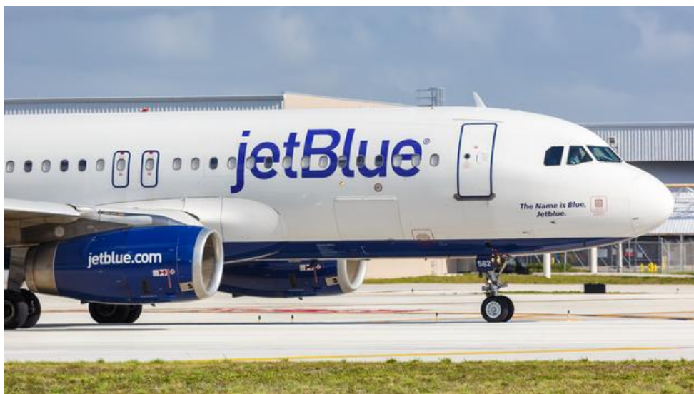
JetBlue Airbus A320 in Fort Lauderdale, Florida.

AIRLINES & AIRPORTS | RICH THOMASELLI | FEBRUARY 23, 2021