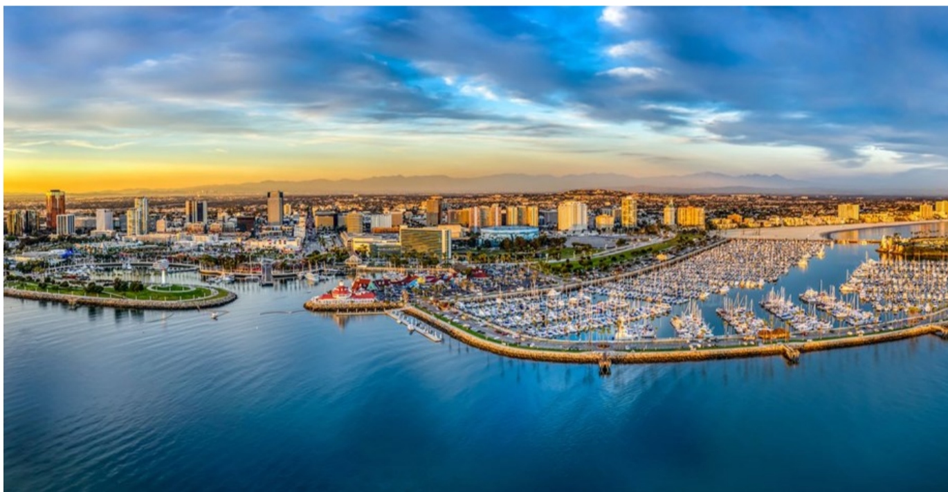
California's Long Beach Bay Area

A slew of California tourism officials and union leaders are calling on Gov. Gavin Newsom to issue specific guidelines to clarify when meetings, business events and conventions can resume in the state. In an open letter to the governor signed by 130 tourism professionals – representing convention centers, CVBs, hotels, restaurants and more – the advocates said California is losing bookings to other states through 2022 and beyond, because of the uncertainty around reopening.