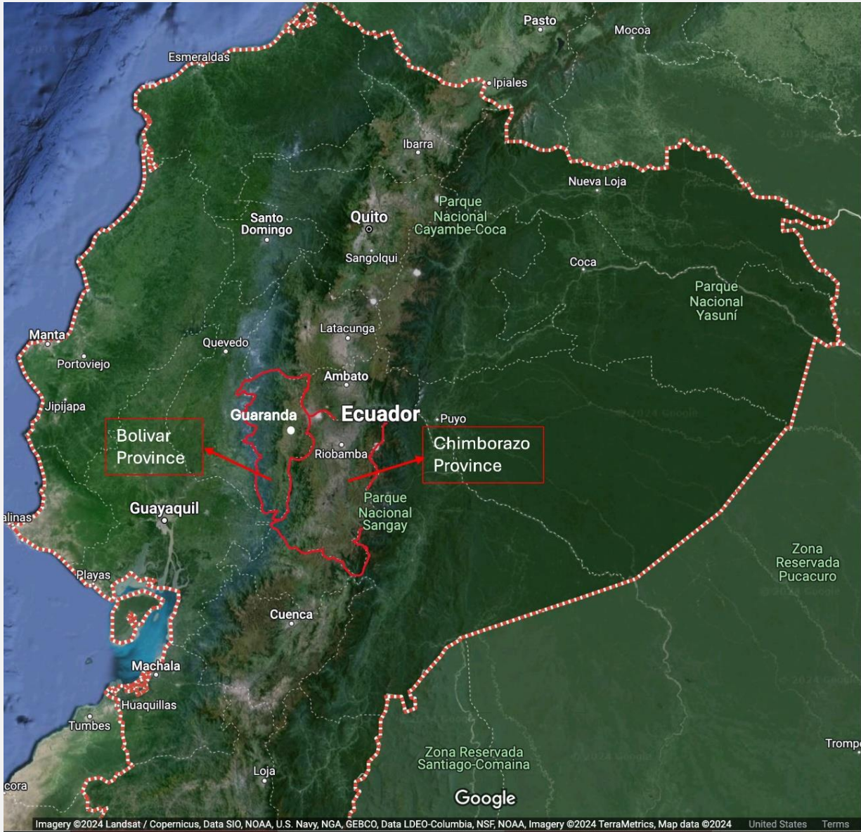
Figure 1: Map of Ecuador with Study Locations.