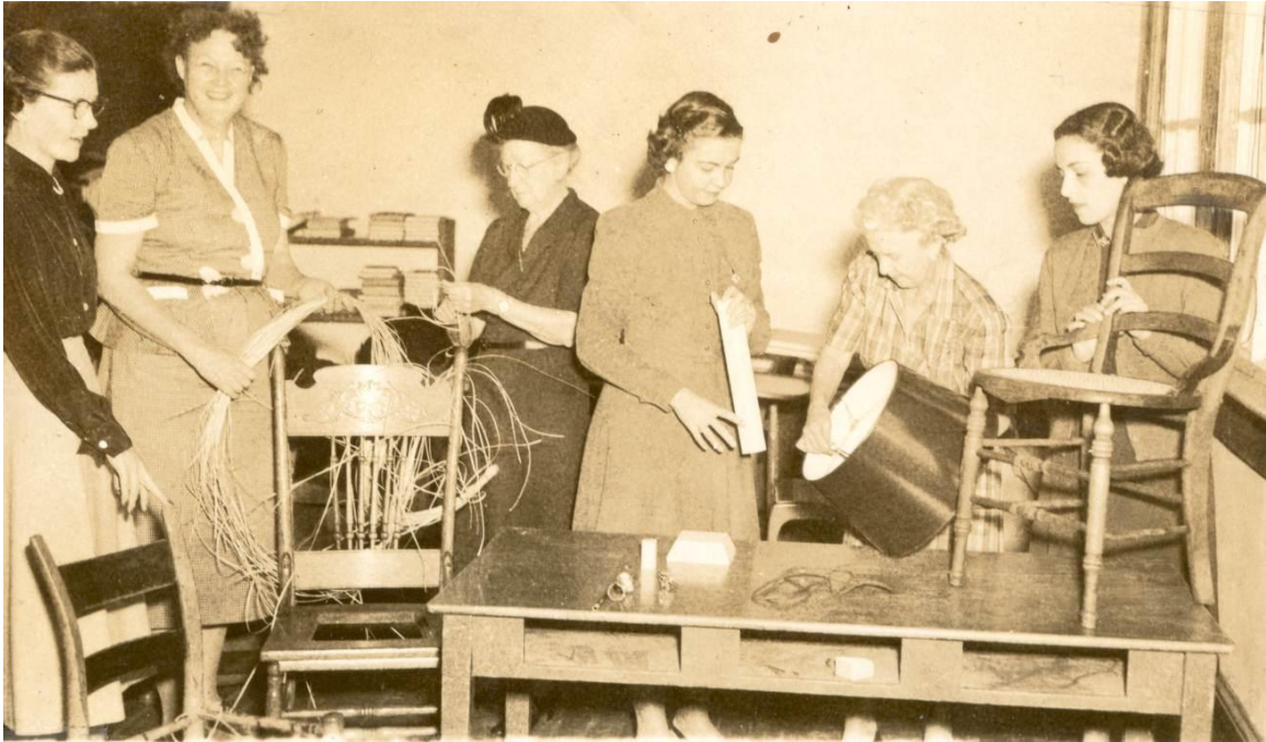
Figure 9. Members of the community demonstrating how to weave the bottoms in chairs. Date of photograph not available.

While the Burke's Garden High had a chapter of the Future Farmers of America, a student organization associated with agricultural education, there were not any student organizations at the school associated with the home economics program. Two factors can be assumed to contribute to the lack of a home economics student organization. The first is the lack of consistency of teachers and the second is the time in which the state and national student organization associated with home economics was formed.