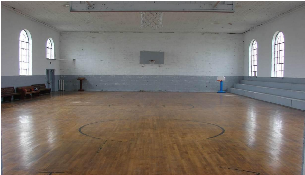
Figure 11. Inside Burke's Garden High School Gymnasium (March 18, 2012).

Eventually, even the elementary school was closed and all the students of Burke's Garden were bused to Tazewell to attend school. In 2012, the elementary school serves as the community center for Burke's Garden. All that is left of the high school is the gymnasium, which stands next to the community center and is used by the community for various events (see Figures 11 and 12).