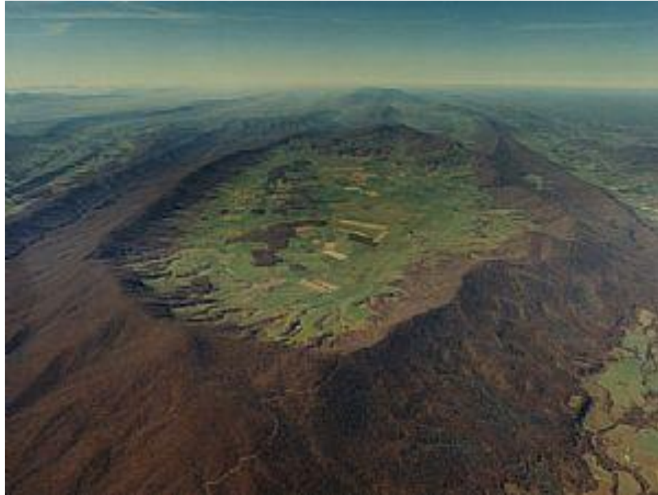
Figure 1. Aerial view of Burke's Garden (Virginia Office of Tourism, 2008).