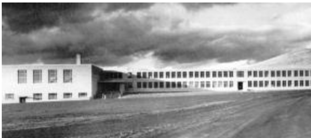
Figure 10. Tazewell High School 1954 (Tazewell County Public Schools, 1954).

In January 1952, the Tazewell County School Board approved the site for the construction of the new Tazewell High School (Tazewell County Public Schools, January 24, 1952). In September 1954, the new Tazewell High School opened (see Figure 10). With a cost over one million dollars, the new high school had the capability to house over a thousand students. The distance from Burke's Garden High School to the new Tazewell High was only approximately fifteen miles. It could be derived that the community realized that with the building of the new high school in Tazewell, the fate of their small Burke's Garden High was in question.