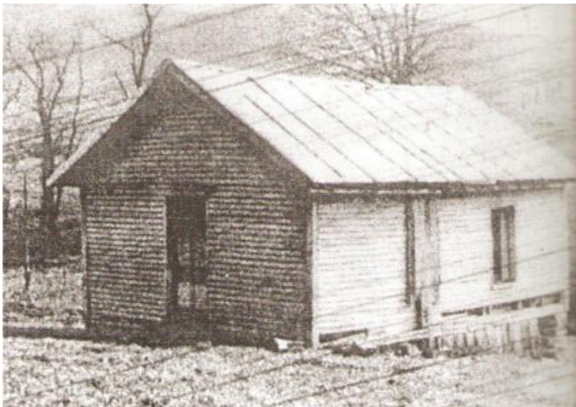
Figure 2. Rhudy School (Leslie & Mullins, 2007).