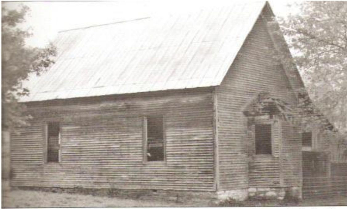
Figure 3. Glade School (Leslie & Mullins, 2007).

In 1895, the Greever Academy (see Figure 4) opened to give the young people of the area an opportunity for an education. The school was owned and operated by the Greever family until 1910 (Leslie, 1982, pp. 603-604). The members of the family were college educated and provided a preparatory curriculum to encourage their graduates to go on to college. The academy was a large structure consisting of two rooms downstairs and two small rooms on the sides. All grades, including high school, were taught in the two rooms. Music and business were taught in the two smaller rooms. There were ten rooms upstairs for boarders (Leslie, 1982, p. 603).