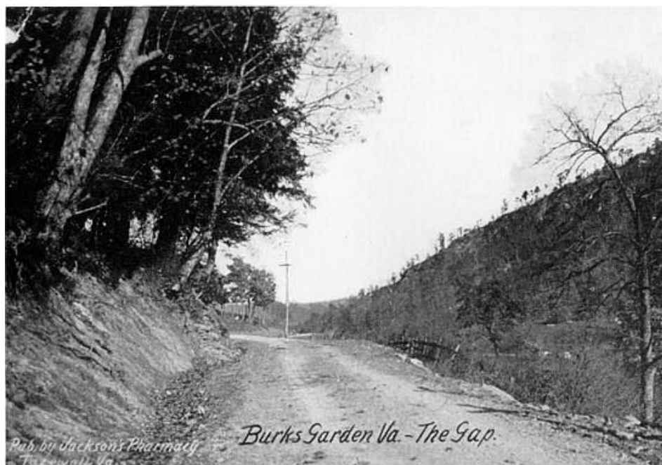
Figure 7. Road through the gap to Burke's Garden circa 1915.

The geography of Burke's Garden did not present the disadvantages that other surrounding rural communities faced concerning difficulties of students attending school on a regular basis. The school was centrally located in the middle of the community. According to Fowlkes' (1916) term report, because of the school's location, the furthest distance any student had to travel was three miles. While travel inside Burke's Garden was good, travel to and from the area across the mountains was treacherous in the early years of the school as seen in Figure 7.