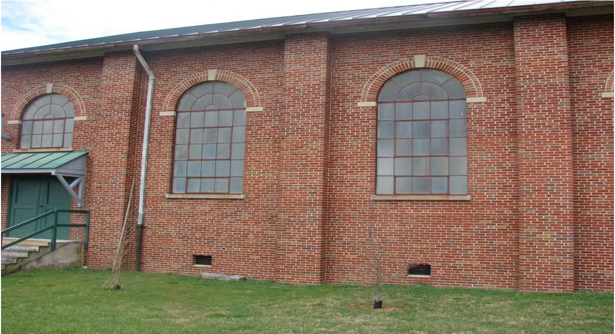
Figure 12. Outside Burke's Garden Gymnasium. (March 18, 2012).