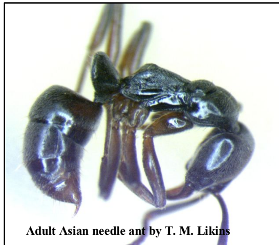
Adult Asian needle ant by T. M. Likins

DESCRIPTION: The Asian needle ant is a small, dark brown to black ant that has antennae tips and legs that are often lighter or orange-brown in color. The workers are typically 5 mm in length and a queen may be 6.5 mm in length.