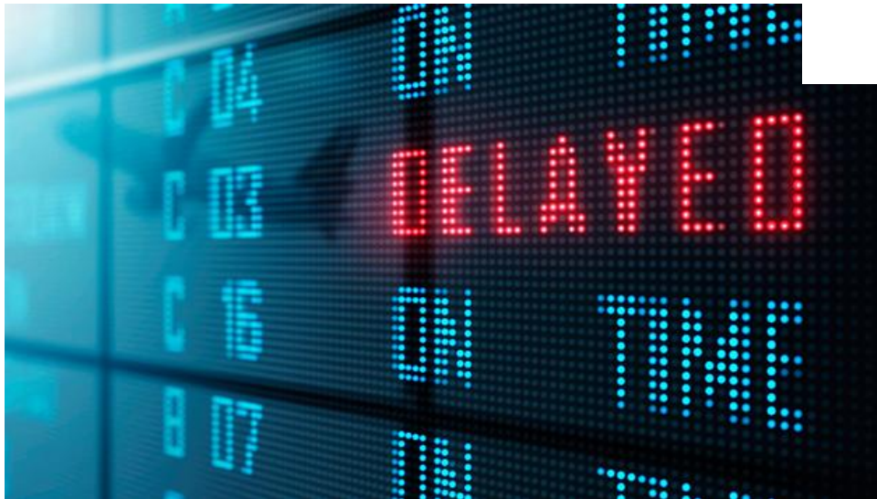
Airport flight status board.

AIRLINES & AIRPORTS | AMERICAN AIRLINES | RICH THOMASELLI | OCTOBER 31, 2021