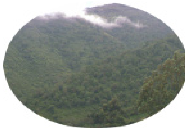
A section of Aberdares Forest

The Project also hopes to revisit its already established sites to determine changes in the governance of the forest. Through this, Resource and Recourse diagrams will be drawn up indicating the level of decentralization in forest management.