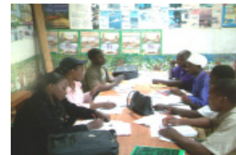
Some members during one of the training on SANREM data collection methods

The project trains various types of stakeholders in each SANREM site. The stakeholders include community members, government officials and other local and international actors. The community is trained on issues such as PFM principles and the New Forest Act aimed at including community members in decision making on forest issues and general forest governance.