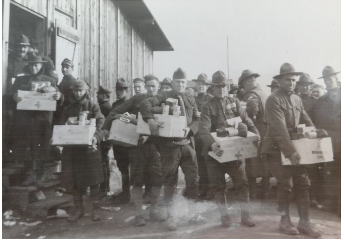
American prisoners of war at Rastatt receiving care parcels, 1918.