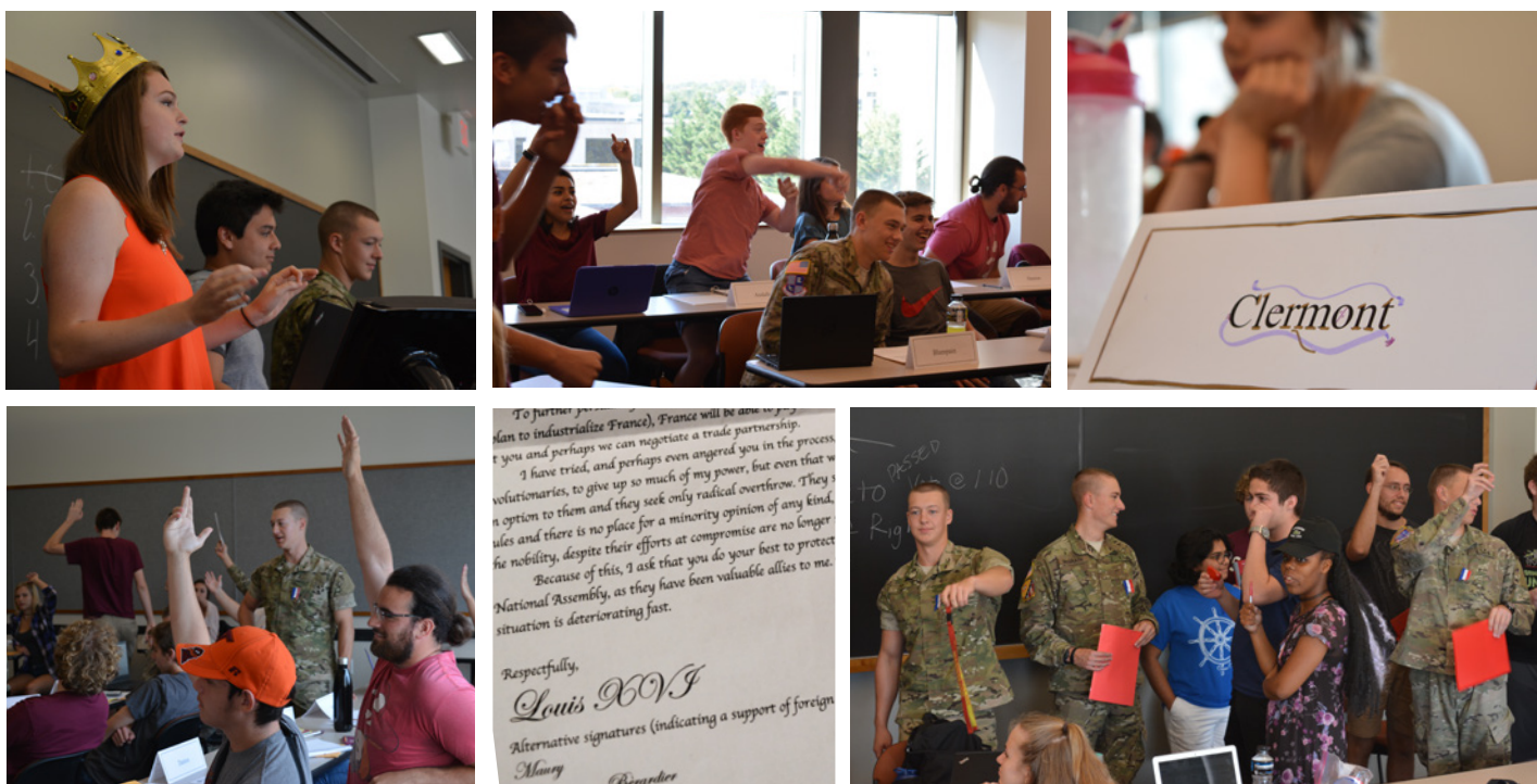
(Clockwise from top left) 1. King Louis XVI pleads to the National Assembly, 2. People of Paris start first of several riots, 3. Name cards identify delegates 4. Marshall Law is called by Lafayette, 5. A letter from King Louis to the Austrians and Prussians, 6. The Assembly votes