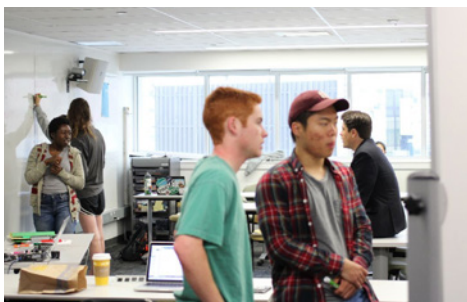
Seeking Sustainability class