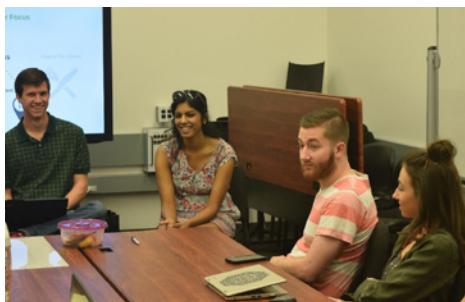
Create! Ideation for Innovation class