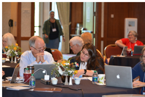
(Clockwise from top left) 1. Pathways Minor Matchmaking, 2. Sharing best practices, 3. Proposal writing workshop, 4. Getting down in the weeds of Pathways Minor development.