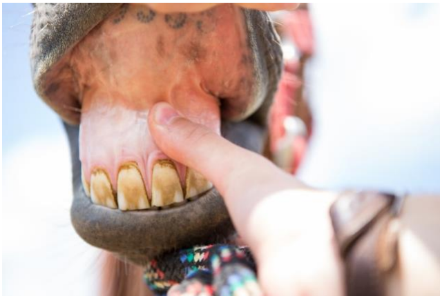
Figure 6. Gum condition can be a measure of animal health.

You can also assess capillary refill time. A horse or other animal with abnormal gum color and abnormal capillary refill time may be in shock or may be bleeding internally. Gums should appear medium pink in color, not whitish or red (figure 6). If you lift the lip and press a finger against the gums, color should return to the area within one to three seconds of releasing your finger.