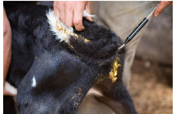
Figure 1. You may opt to use a digital temperature.