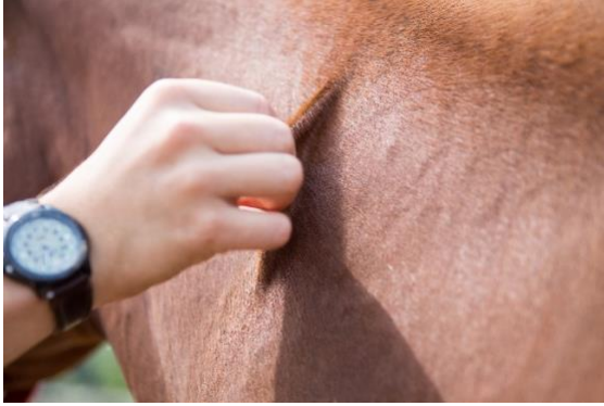
Figure 5. A skin pinch test can alert you to check for dehydration in an animal.

You can also assess capillary refill time. A horse or other animal with abnormal gum color and abnormal capillary refill time may be in shock or may be bleeding internally. Gums should appear medium pink in color, not whitish or red (figure 6). If you lift the lip and press a finger against the gums, color should return to the area within one to three seconds of releasing your finger.