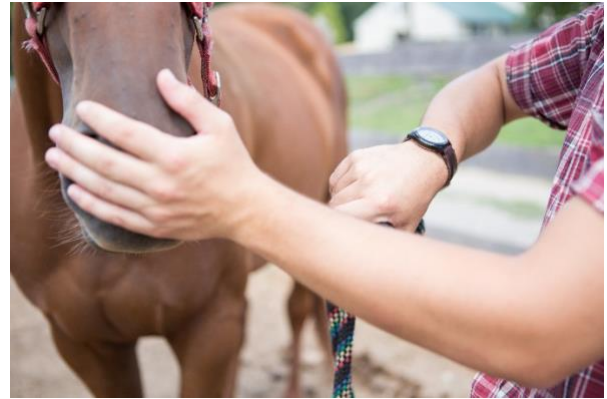
Figure 4. You can measure an animal's respiration rate by observing breaths at the nostrils.