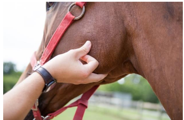
Figure 2. You can locate an artery on the edge on edge of the jaw.

As with cattle, the external maxillary artery crosses the lower edge of the jaw, just in front of the masseter (cheek) muscle. When you place your fingers flat on the cheek in front of the masseter muscle and move them back and forth, you can easily feel the artery. You can also measure pulse on a horse on the left side of the chest, just under the elbow, in which case it may be helpful to ask the horse to step a bit forward on the left side. Some horse owners measure the digital pulse—this can be felt on the back of the pastern above the coronary band or just above the pastern joint. However, digital pulse can be more difficult to locate than the pulse behind the elbow or on the edge of the jaw. This reading is used by some horse owners to indicate possible cases of laminitis, as a horse with laminitis may experience a throbbing digital pulse.