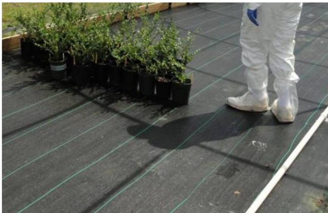
Figure 2: Store plants on easy-to-clean surface such as weed mat over well drained gravel.