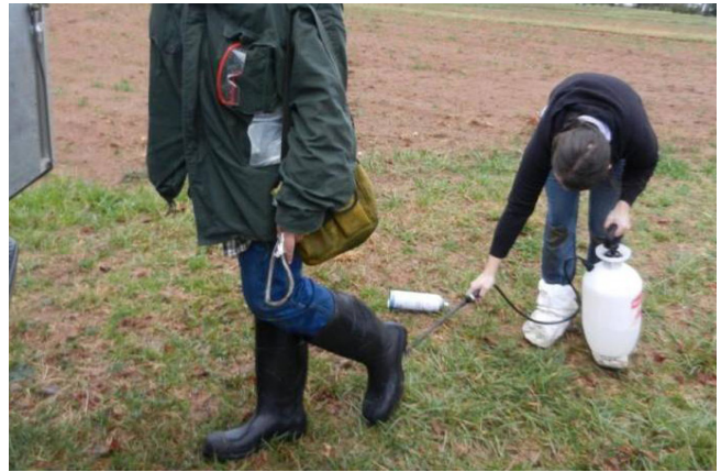
Figure 3: Clean and sanitize boots between hoop houses or display blocks.