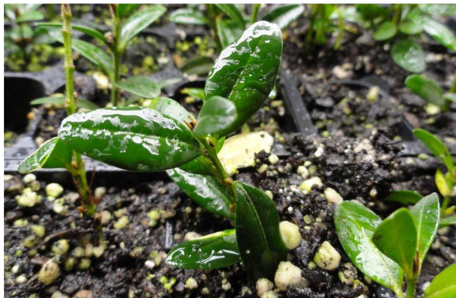
Figure 5: When using overhead irrigation, water plants so as to reduce leaf wetness period.