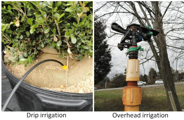
Figure 4: Use drip irrigation to reduce leaf wetness period whenever possible.