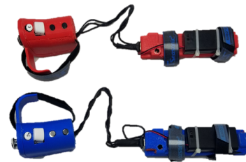
Figure 3: Fabricated and Assembled L2OrkMote

The L2OrkMote prototype was fabricated via the material extrusion additive manufacturing process, providing the ability to rapidly iterate and improve in the spirit of the open source, collaborative nature of laptop orchestras [6]. The intention is to tune the L2OrkMote to an individual orchestra’s needs and later, possibly down to the individual user, rather than mass-produce it. Mass customization such as this is perfectly suited for additive manufacturing [33]. Considering the L2Ork ensemble’s infrastructure leverages open-source solutions wherever possible, in part because of its ongoing K-12 outreach mission, the L2OrkMote enclosure design will be made publicly available with the necessary supporting documentation. The complete, assembled L2OrkMote prototype can be seen in Figure 3.