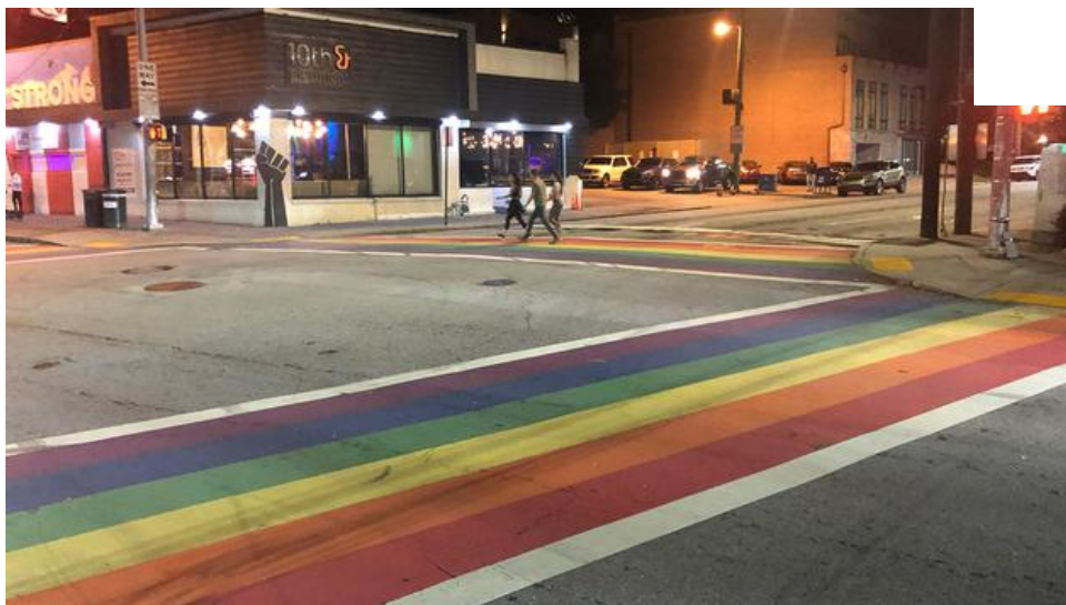
Atlanta rainbow crosswalks at 10th and Piedmont in Midtown.

I attended college in downtown Atlanta a few decades ago, while I was a closeted gay teen. When gay life was discussed at my very conservative college, it was occasional snippets of information, vague assertions that a certain building might contain a gay bar or whispers about specific people’s inclinations.