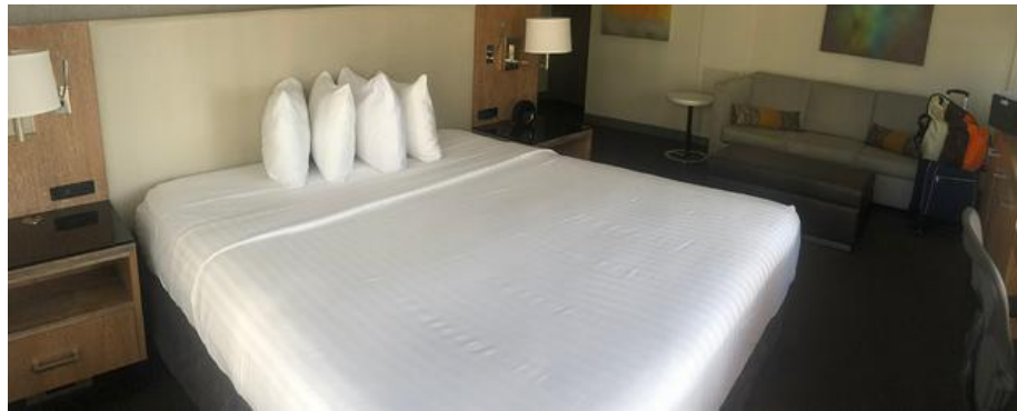
Room at the Hyatt Centric Midtown Atlanta.

quite filling. The customers here were a 50/50 split between straight and queer couples, and in some of the other nearby restaurants like 10th & Piedmont and Joe's on Juniper, the mix can be even more heavily weighted to the queer crowd.