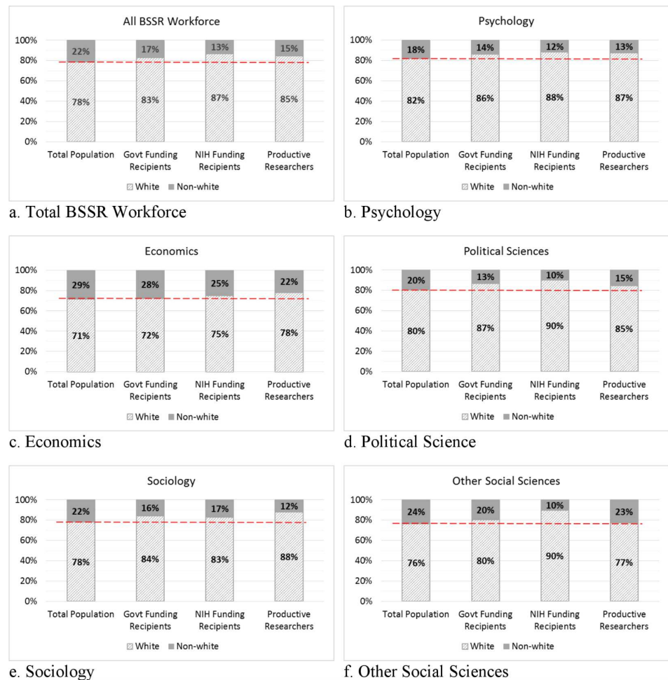
Fig 1. Racial/ethnic distribution of scientists in academic positions by major field.

Additionally, we analyze gender and racial distribution among funding recipients and productive researchers. Fig 1 compares white vs. non-white researchers among the entire group of BSSR in academia (1a) and for the subfields within BSSR (1b-1f) in terms of funding distribution and productivity. In each graph, moving from left to right, the bars show: the distribution of the population (percentage white vs. non-white); the distribution of the population that received government funding; the distribution of people who received NIH funding; and the