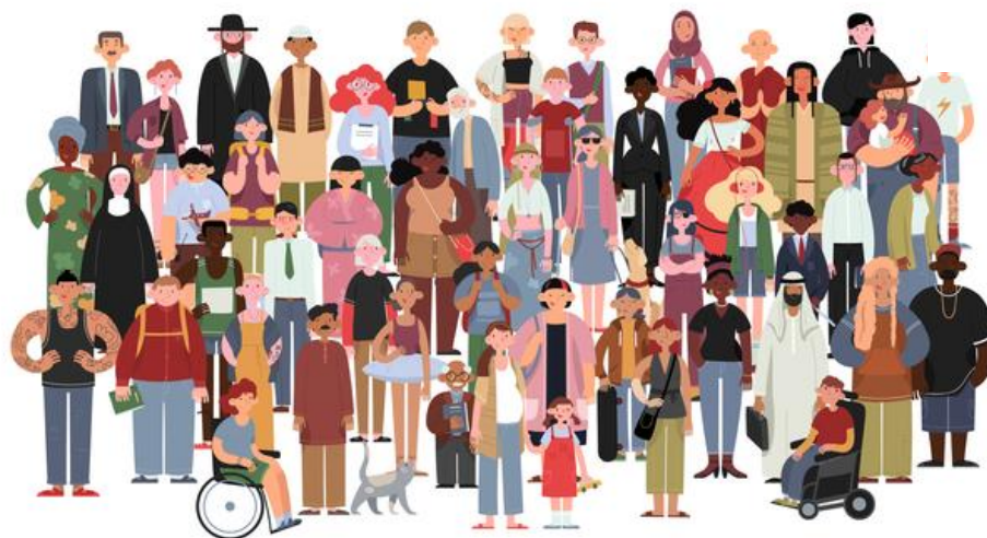
Artistic representation of the value of social and ethnic diversity.