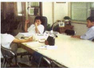
Mayor Jesse Robredo of Naga City

Naga City is known for taking the initiative in developing its Naga River Watershed Plan. It covers a total land area of 5,445 hectares where about 3,665 hectares falls within the political boundary of Naga City. To support the plan, the city government enacted an Ordinance saving the aquatic life of Naga River where the annual Fluvial Procession of Sta. Peñafrancia is held.