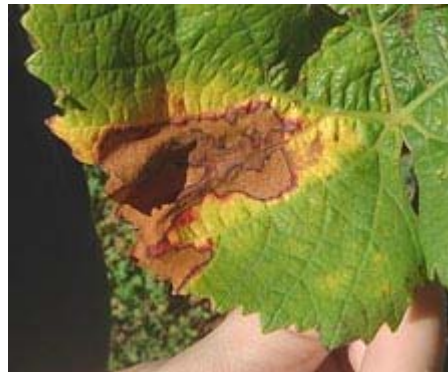
Fig. 2. Marginal necrosis with accompanying red line.