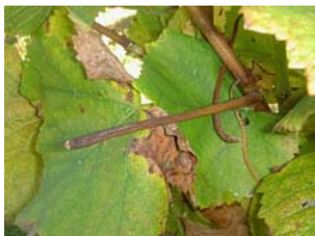
Fig. 3. "Matchstick petiole" symptom of Xylella fastidiosa -infected vine.

Thirty-one vineyards in twenty counties were sampled for X. fastidiosa in late fall, 2006 (Fig. 4). Most vineyards contained Vitis vinifera L. vines, and in most cases, vinifera varieties, primarily 'Chardonnay,' were sampled. Exceptions were vineyard 13 with Vitis labrusca 'Concord' and 'Niagara'; vineyard 19 where one of two samples was the interspecific hybrid, 'Vidal'; and vineyard 20, in which hybrids 'Foch' and 'Seyval' were sampled. Ten symptomatic vines were selected from edge rows of vineyards 1 to 14. Four vines were sampled in vineyards 26 and 28 to 31, and two in vineyards 15 to 25 and 27. Sampled vines displayed at least one of the characteristic aforementioned PD symptoms. In vineyards 1 to 14, two samples were taken from each vine, petioles closest to the cordon and from petioles most distal. Petioles were collected from the most symptomatic leaves in vineyards 15 to 31. Each sample, comprised of three petioles cut and weighed to be 0.3 to 0.5 g (average total length ~2 cm), was ground in a mesh grinding bag with 3 ml of general extract buffer (Agdia Inc., Elkhart, IN.). Each sample was placed into two testwells (100 \mu l each) and tested for X. fastidiosa using Agdia's DAS-ELISA PathoScreen kit (Agdia Inc.). Absorbance at 650 nm was recorded with a Spectramax Plus (Molecular Devices, Sunnyvale, CA). Samples giving values greater than the mean absorbance of known negatives plus three times the standard deviation of known negatives were considered positive.