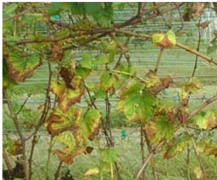
Fig. 1. Marginal necrosis with accompanying yellow line.

Pierce's disease (PD) is a vascular disease of grapes caused by the bacterium Xylella fastidiosa Wells et al. and vectored by xylem-feeding sharpshooters (1). Symptoms of PD occur when bacteria proliferate the xylem; both the bacteria (2) and host responses to infection (3) block the flow of xylem fluid to the shoots. Affected grapevines show interveinal chlorosis, marginal necrosis with marginal yellow or red line (Figs. 1 and 2), green islands on shoot bark after normal tissue turns brown, and leaf abscission from the distal end of petioles, leaving characteristic "matchstick petioles" with necrotic tips (Fig. 3). Infection leads to vine decline, yield loss, and, within two to three years, vine death. Although the northern distribution of X. fastidiosa [* see Erratum] extends at least into New Jersey, observations of PD have been limited to vineyards on the Delmarva Peninsula and extreme southeastern Virginia; interior Virginia was considered at low risk of PD because of its low winter temperatures (lethal to the bacteria), based on the results of past research that showed lower pathogen populations in plants grown at low temperatures in a growth chamber (4). Recent warm winters have, however, increased our concerns about vulnerability of other Virginia vineyards to PD. Our objective was to conduct a state-wide survey of Virginia's vineyards for presence of X. fastidiosa .