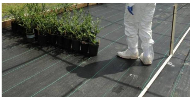
Figure 4: Store plants on easy-to-clean surface such as weed mat over well drained gravel.