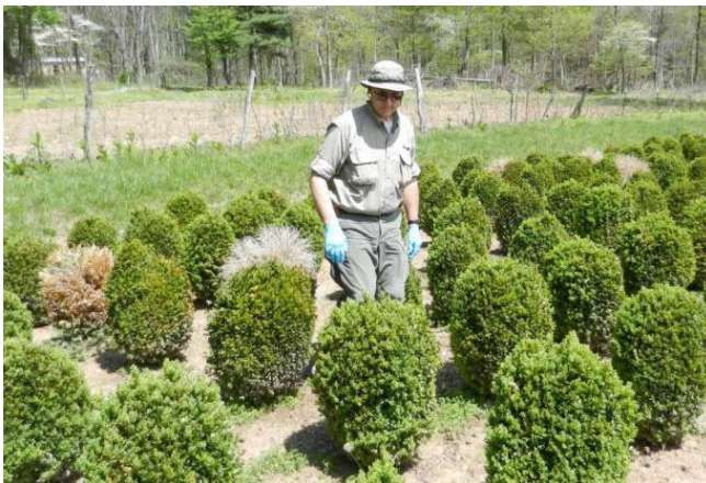
Figure 7: Scout host plants frequently.