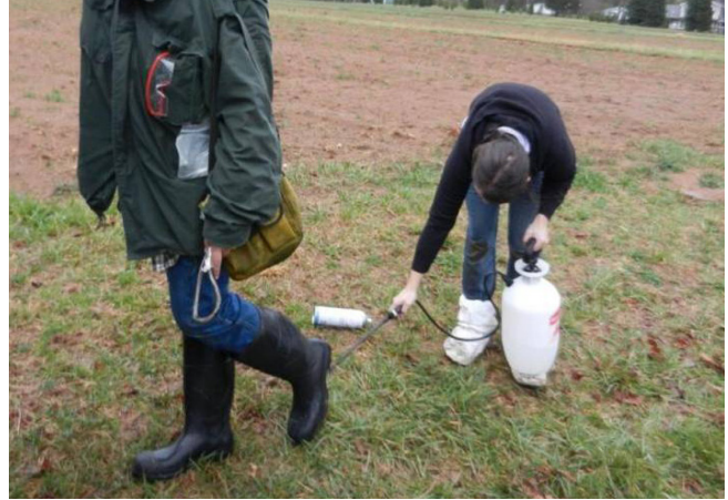
Figure 5: Clean and sanitize boots between hoop houses and productions fields.

V. Use new or sanitized pots/flats that have been thoroughly cleaned of soil and plant debris for host plant production. Do not reuse potting mix previously used in host plant production.