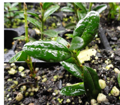
Figure 1: Take steps to reduce leaf wetness period during propagation.

B. Take extra precaution when purchasing plant material.