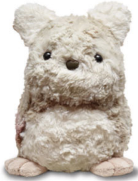
Fig. 2 Purrble, taken from www.purrble.com (accessed 10-01-2020)