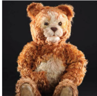
Fig. 1 Teddy

In the following two sections, ERA will be applied to both fictional and existing smart robot toys, to determine whether ERA can be applied to a broad range of technological features in smart robot toys.