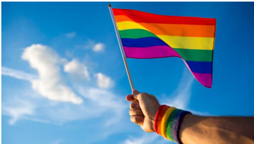
Rainbow Railroad helps members of the LGBTQI+ community escape state-sponsored persecution and violence.

WHY IT RATES: The partnership provides members of the LGBTQI+ community life-saving pathways to freedom. --Janeen Christoff, TravelPulse Senior Writer