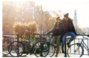
The Best Travel Companies for LGBTQ+ Equality

The incredible work of Rainbow Railroad is highlighted, for example, by their ongoing response to the humanitarian crisis in Afghanistan caused by the Taliban’s return to power, which has put LGBTQI+ individuals at serious risk. Since August, the organization has helped close to 100 LGBTQI+ Afghans relocate to Europe and has helped hundreds more stay safe with livelihood support and evacuation to neighboring countries.