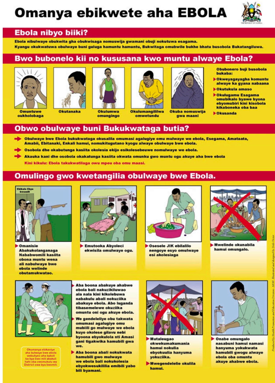
Figure 1: A poster on EVD in the local language. Used with permission from UNICEF.