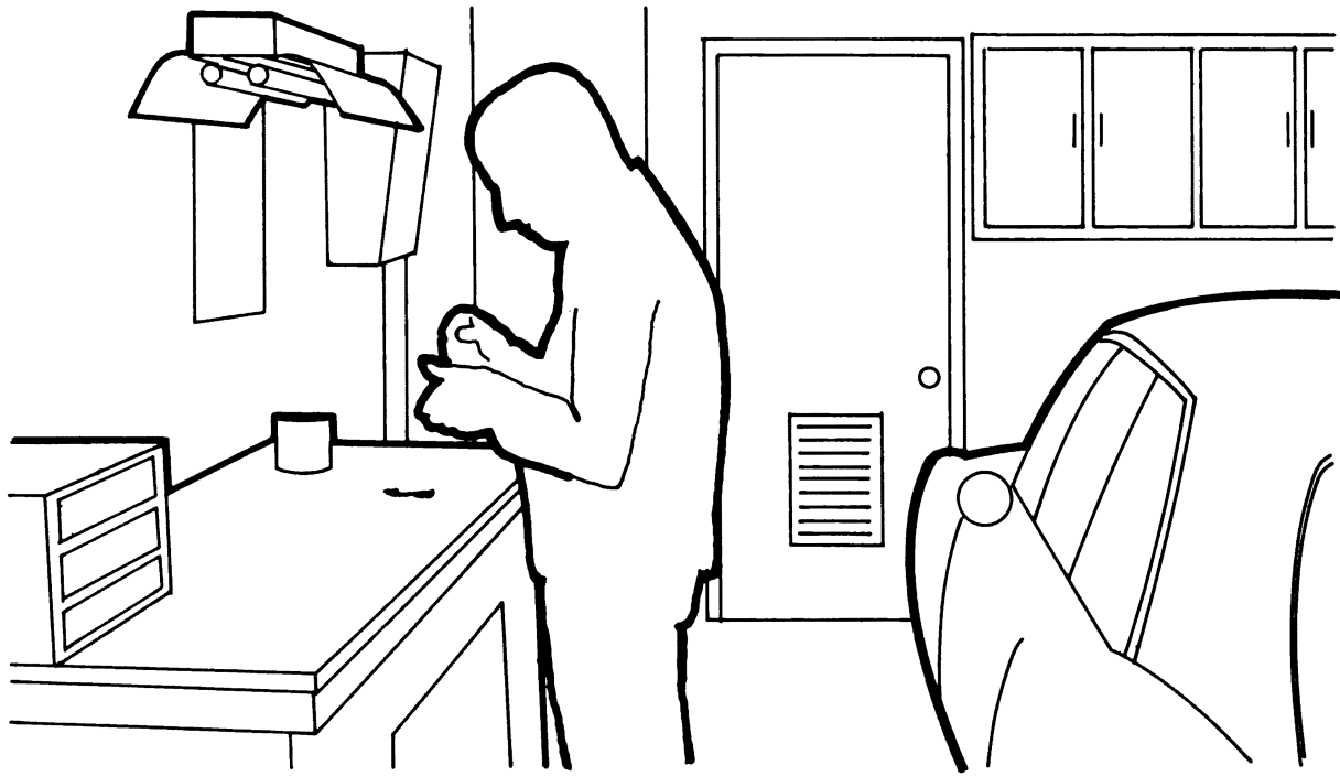
Garage layout showing adequate lighting & clearance.