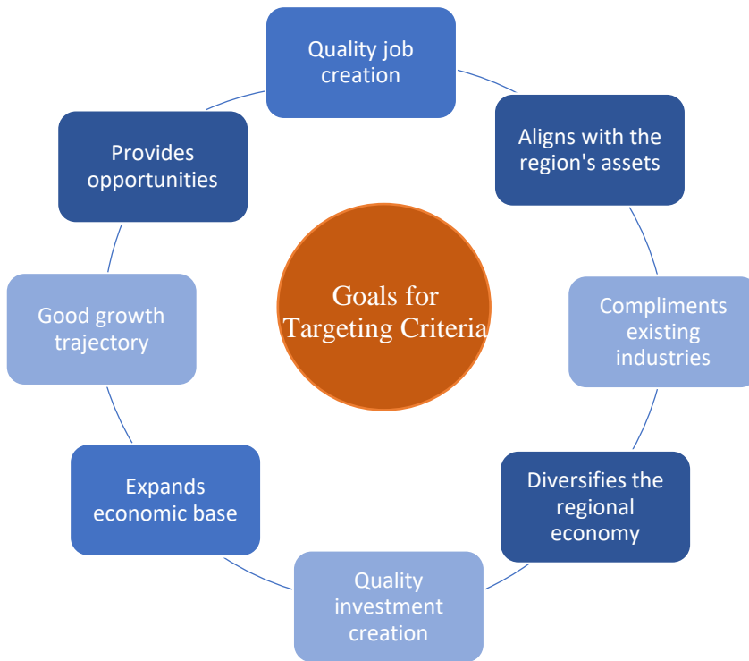
Figure 1: Eight Goals for Targeting Criteria

At the outset, we worked with VCEDA staff to identify a set of criteria against which to assess potential target industry sectors. The overall purpose of the analysis is to aid the organization in developing a more targeted comprehensive strategy to attract and retain world-class jobs, investment and talent in the Virginia Coalfield region. To that end, potential industry sectors were assessed against the following criteria: