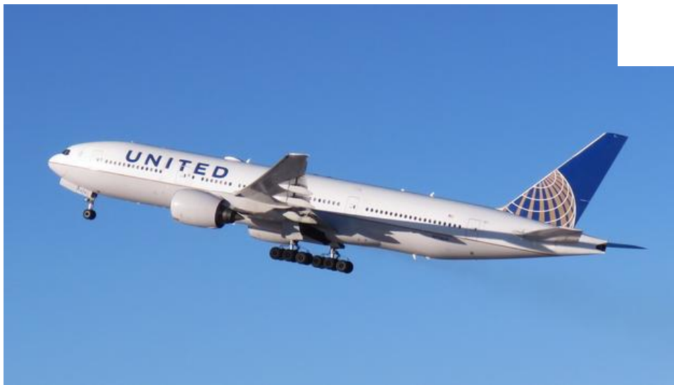
United Boeing 777