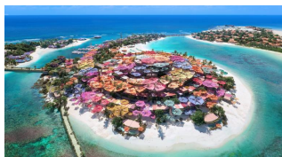
What's inside the nine new hotels opening at Saudi Arabia's Red Sea...