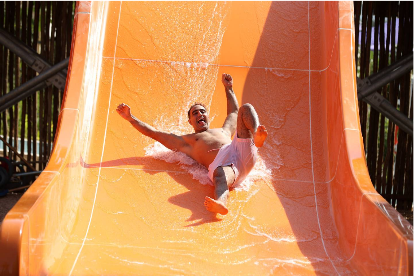
Waterslides at the Centara Mirage Beach Resort Dubai

The resort is inspired by mythical Thai and Arabian adventures, and brightly painted elephants, murals and decor can be found throughout the hotel, including in the colourful Mirage Family Lounge where beanbags, games, and refreshments await the whole family.