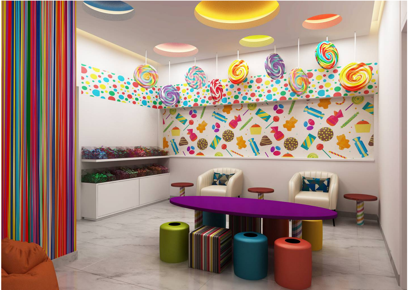
The children's candy-themed spa at Centara Mirage Beach Resort Dubai.

As well as having its own waterpark complete with a beachfront swimming pool, waterslides, rock jumping points and a meandering lazy river, the hotel also has an outdoor playground, an aerial obstacle course and a candy-themed spa that's only for youngsters.