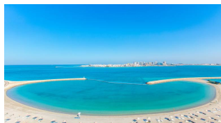
Dubai's Emaar to open first Vida hotel outside the UAE in Bahrain