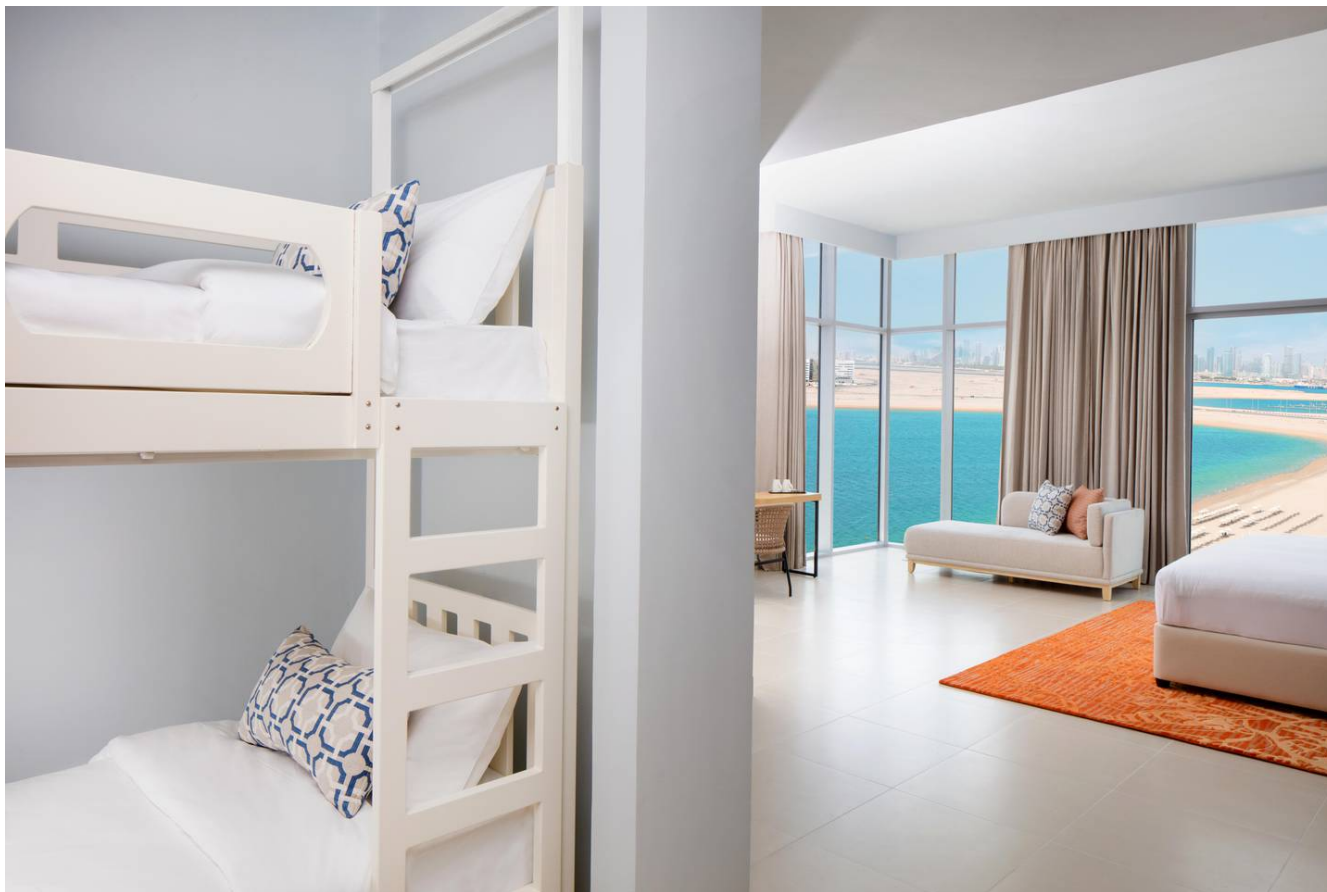
The family-themed Centara Mirage Beach Resort Dubai even offers bunk-bed rooms.

With more than 600 rooms at the hotel, there's guaranteed to be one to suit every size of group. In keeping with the family theme, Centara Mirage Beach Resort Dubai offers a choice of private rooms, interconnecting rooms, bunk beds rooms and larger two-bedroom suites.