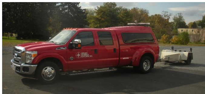
FIGURE 2 Skid Resistance Tester.