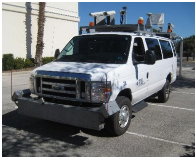
FIGURE 1 Digital Survey Vehicle.