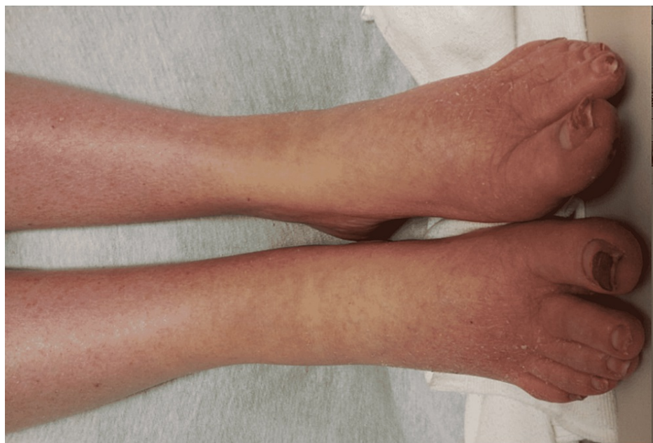
FIGURE 2: The patient's extremities revealed dry skin and non-pitting edema.

A chest radiogram showed cardiomegaly with globular enlargement of the cardiac silhouette with a “water bottle” configuration (Figure 3). An electrocardiogram showed a heart rate of 60/minute with a low voltage pattern and first-degree atrioventricular block. There was no evidence of electrical alternans or ST-T wave changes (Figure 4). A bedside echocardiogram demonstrated a small heart size with massive pericardial effusion (Figure 5). There was a swinging motion of the heart, within large effusion; however, there was no evidence of right ventricular and right atrial collapse during the diastole. Pericardiocentesis was not done, given there was no evidence of tamponade clinically and in the echocardiogram.