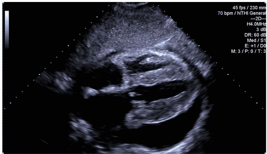
FIGURE 5: A bedside echocardiogram revealed massive pericardial effusion.

Laboratory values were also obtained for diagnostic purposes. A complete blood count (CBC) showed leukopenia and anemia. A thyroid function test revealed her ultrasensitive thyroid-stimulating hormone (TSH) was greater than 100 Uiu/ml and free T4 was 0 ng/dl. The afternoon cortisol level was 12.2 mcg/dL. The patient's creatinine phosphokinase was 3288 units. Liver function tests were significant for aspartate aminotransferase (AST) and alanine aminotransferase (ALT) of 196 u/L and 145 u/L, respectively, with alkaline phosphatase and total bilirubin within normal limits. Thyroglobulin and thyroperoxidase antibodies were negative. The etiology of hypothyroidism was unclear but suspected to be underlying thyroiditis possibly due to infectious causes.