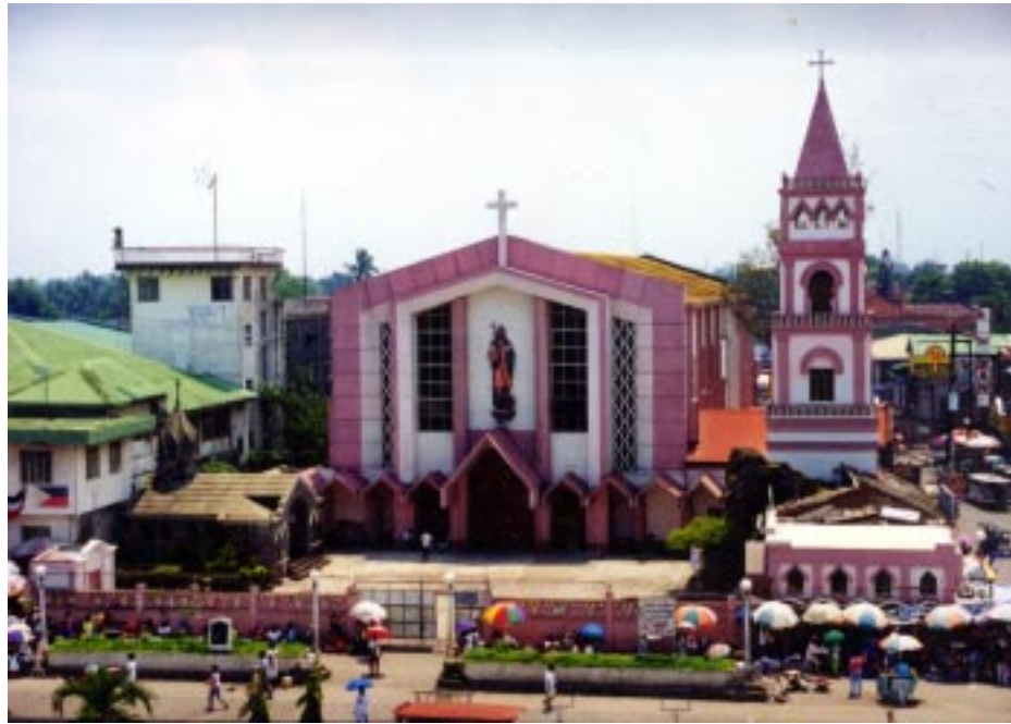
Figure 6. Photo. 1 - Parish Church