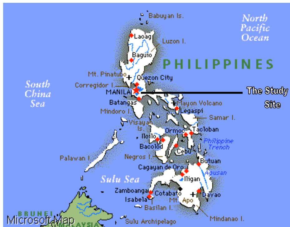
Figure 5. The Study Site