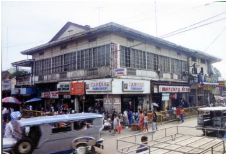
Figure 11. Photo 6 – Retail shops on the South Side of the Basketball Court