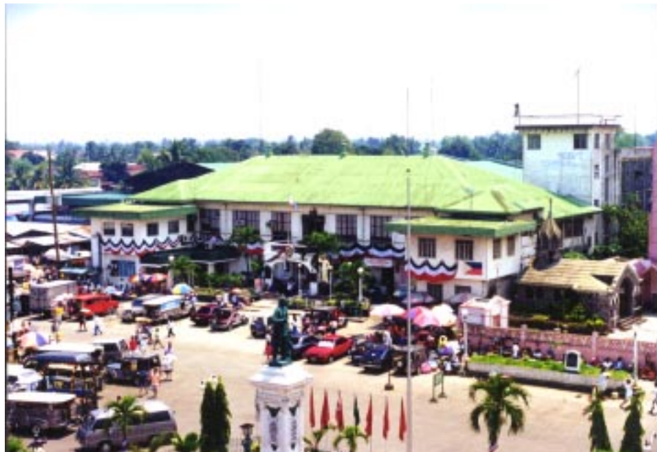
Figure 7. Photo 2 – Municipal Building