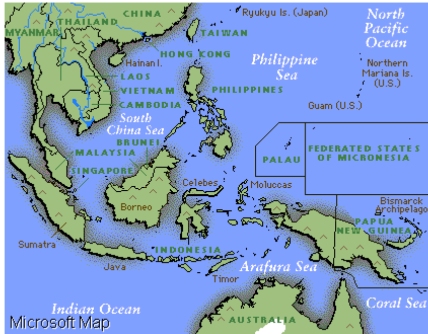
Figure 4. Location of the Philippines in the Southeast Asia Region