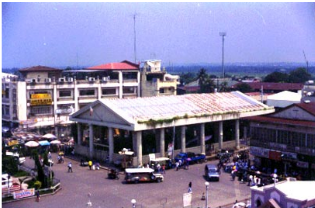
Figure 9. Photo 4 – Basketball Court