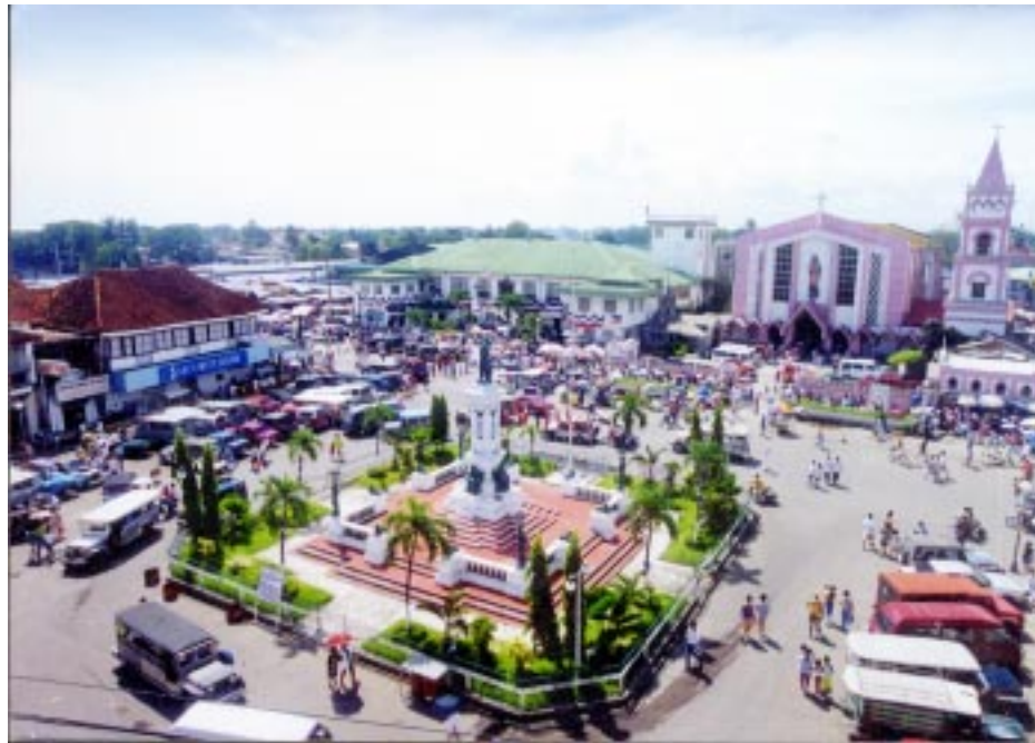
Figure 15. Photo 10 – Binan Town Center