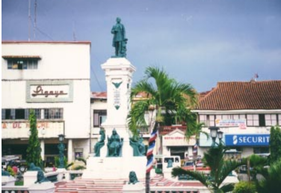
Figure 10. Photo 5 – Rizal Monument