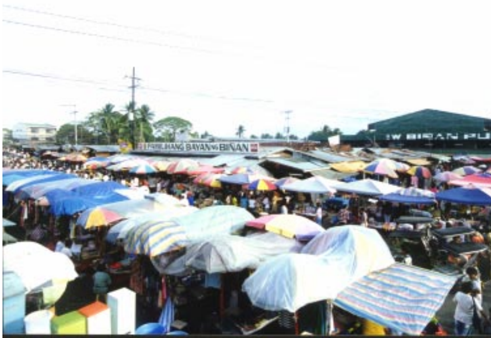
Figure 8. Photo 3 – Public Market