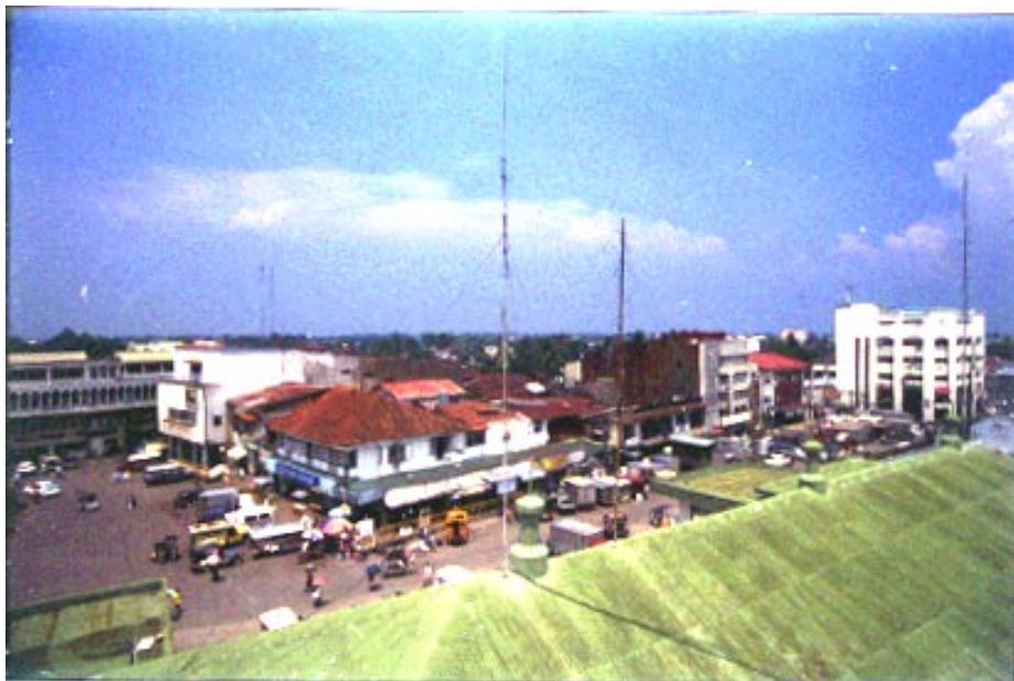
Figure 13. Photo 8 – Retail Shops Facing the Public Market