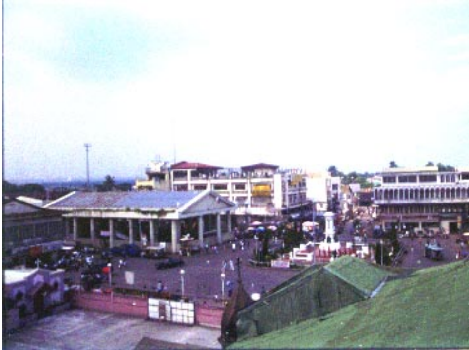
Figure 12. Photo 7 – Retail Shops facing the North Side of Rizal Monument and Basketball Court