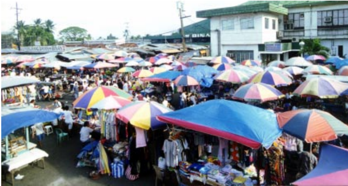
Figure 14. Photo 9 – Street Vendors