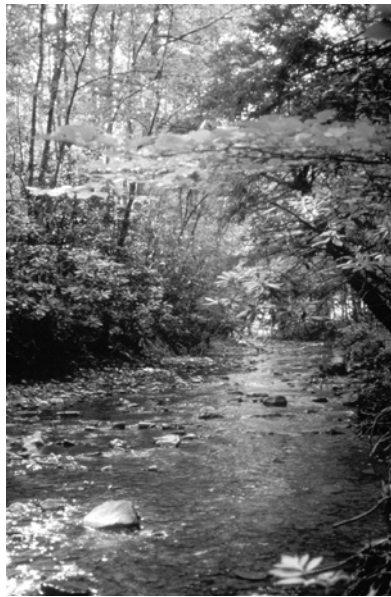
Fig. 1. Virginia's streams are an important natural resource.

The Commonwealth of Virginia has over 50,000 miles of streams, 248 publicly owned lakes, and almost 2,500 miles of coastal estuary. These waters play an important role in industry, transportation, and agriculture and provide Virginia's citizens with a place to relax and enjoy the out-of-doors (Figure 1). They are a source of fresh drinking water and home to many of the state's plants and animals.