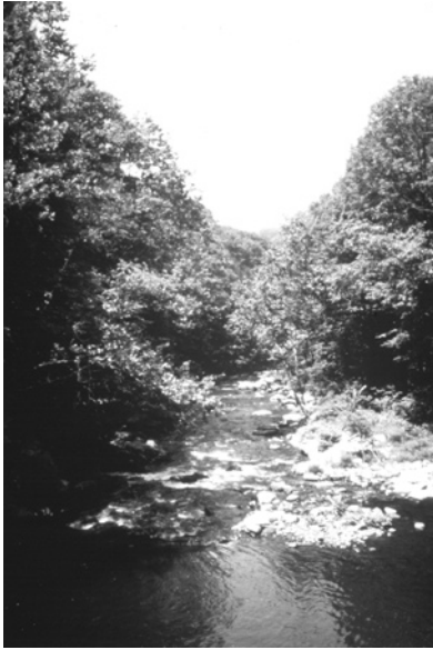
Fig. 3. One of the most important functions of riparian areas is to protect water quality.

One of the most important functions of riparian forests is to protect water quality by reducing the amount of sediment, nutrients and other pollutants that enter streams, lakes, and other surface waters (Figure 3). Improved water quality mainly occurs as contaminants are buried in sediments, taken up by riparian vegetation, adsorbed onto clay and organic particles, immobilized, or denitrified by soil microorganisms.