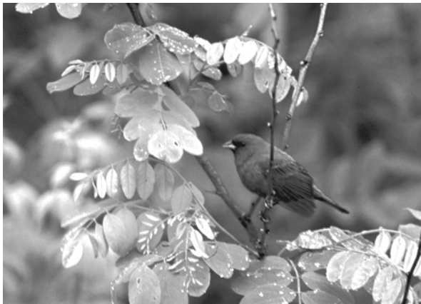
Fig.4. Riparian forests provide habitat for many animals.

Rich soils, regular inputs of nutrients, and water availability contribute to the high productivity and diversity of vegetation within the riparian area. The diversity and productivity of the riparian plant