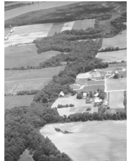
Fig. 2. The riparian area is that area of land located adjacent to streams, lakes, or other surface waters.

The riparian area is that area of land located immediately adjacent to streams, lakes, or other surface waters (Figure 2). Some would describe it as the floodplain. The boundary of the riparian area and the adjoining uplands is gradual and not always well defined. However, riparian areas differ from the uplands with their high levels of soil moisture, frequent flooding, and the unique assemblage of plant and animal communities. Through the interaction of their soils, hydrology, and biotic communities, riparian forests maintain many important physical, biological, and ecological functions and important social benefits.