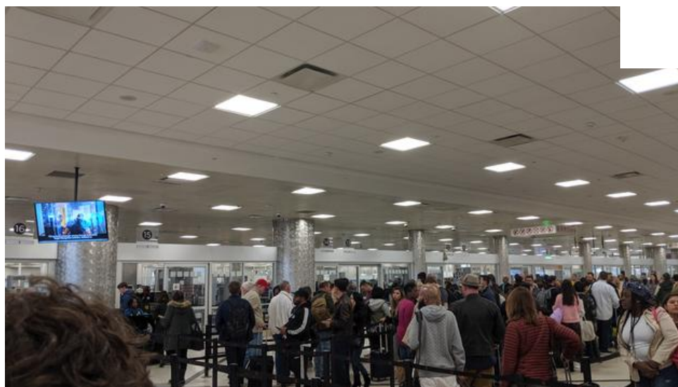
Security lines at the airport.