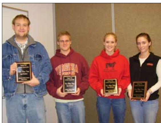
First Place Team