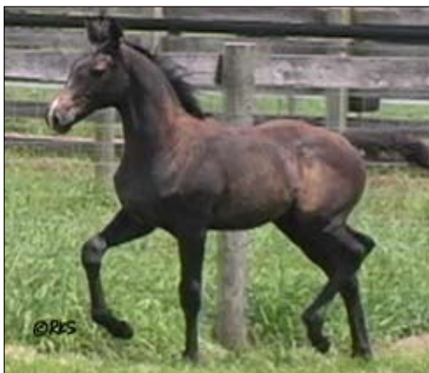
Liberando as a colt