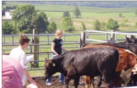
Learning to sort cattle...