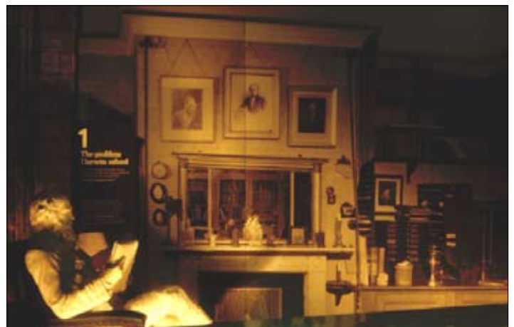
Charles Darwin's library

The aim of these diverse yet synergistic activities is to stimulate a living and ongoing debate over the implications of Darwin and evolutionary thinking within biology, our culture, and our society, at Virginia Tech and within its surrounding communities.