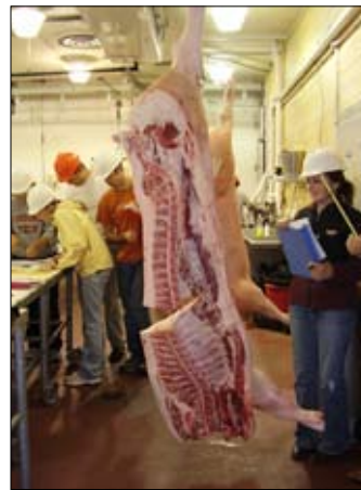
Evaluating pork carcasses

In addition to meeting with folks working in the industry, students in the class also heard from a number of people working with pigs at Virginia Tech, with