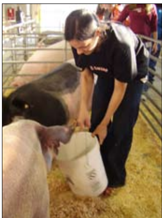
Watering Hokie Harvest pigs

The Sow Project and Hokie Harvest sale give students in Swine Production the opportunity to work with several different age groups of pigs. These are group projects, which also give students the chance to work in teams. With the sow project, they are responsible for the care and management of a sow from the time she is due to give birth until her pigs are weaned. They attend the farrowing, care for the baby pigs, and evaluate their sow's performance compared to all the other sows in the same group. Groups of students also work with the bred gilts and young boars consigned to the Hokie Harvest sale, from the beginning of the semester through sale day the last Friday of October. They designed sales flyers on the animals, generated accompanying photographs, and cared for the animals at the Alphin-Stuart arena the week prior to the sale. At the conclusion of the silent auction, students helped load out their animals for their new owners. This year's swine auction set a new record, grossing $3,470.00 before expenses.