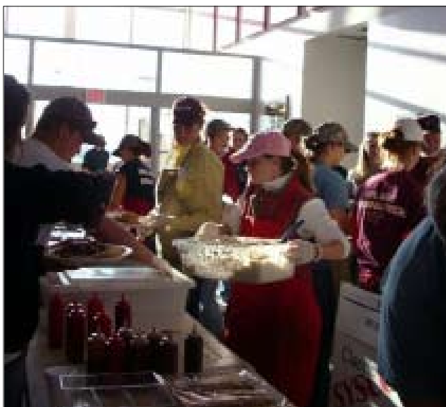
Block and Bridle members serving our delicious barbeque to hungry customers at Hokie Harvest.

The club was very excited to welcome 22 new members this fall semester. From the very beginning this pledge class was eager and willing to work. From learning to prepare large quantities of baked beans, cole slaw and barbeque at the State Fair to obtaining signatures on their initiation "B"s, the new members were an enthusiastic and busy group. The new members have been a fun addition to the club this fall semester!