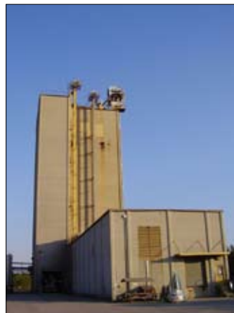
Murphy-Brown's feed mill