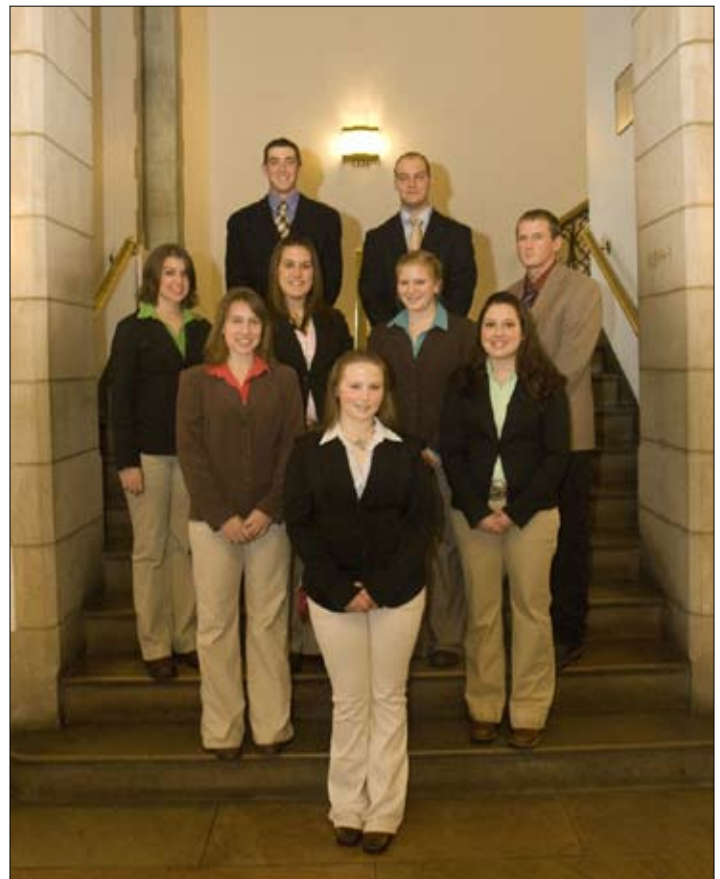
2008 Livestock Judging Team photo.