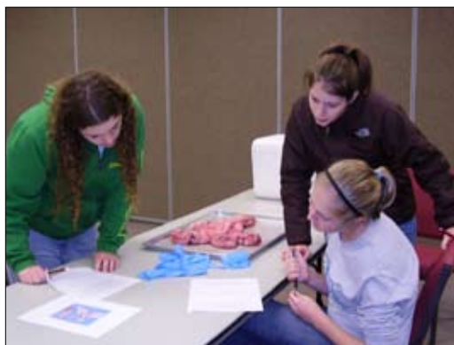
The Freshman Team puzzles over the reproduction practical.

two-day span. A local contest is held at each university to determine which team will represent that university at the regional competition. This year's local competition was held November 8 and 9, 2008. The winning team will represent Virginia Tech at the 2009 regional competition January 30-February 1, 2009 in Georgia.