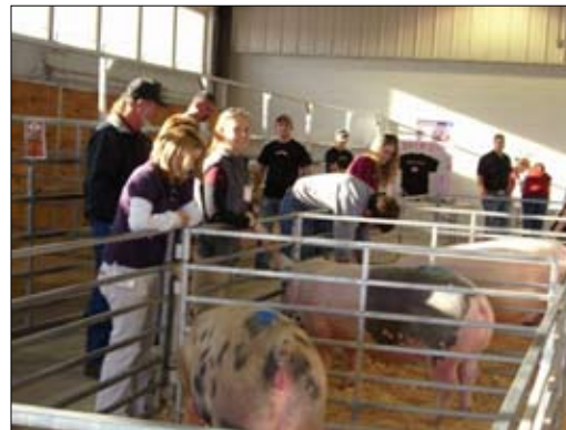
Swine silent auction