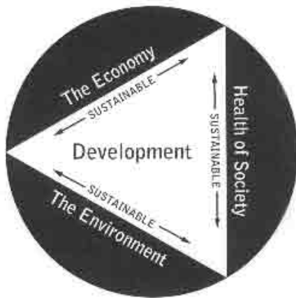
Figure 1: Sustainable Development Triangle (World Conservation Union, 2003)

Although sustainable development may be an abstract concept, the sustainable development triangle provides a simple conceptual framework. As shown in figure 1, sustainable development aims to provide a balance between the economy, the environment and society. The triangle stresses the idea that all sides are interdependent and must coexist in order to promote successful long-term development. Essentially, ecotourism can work as a