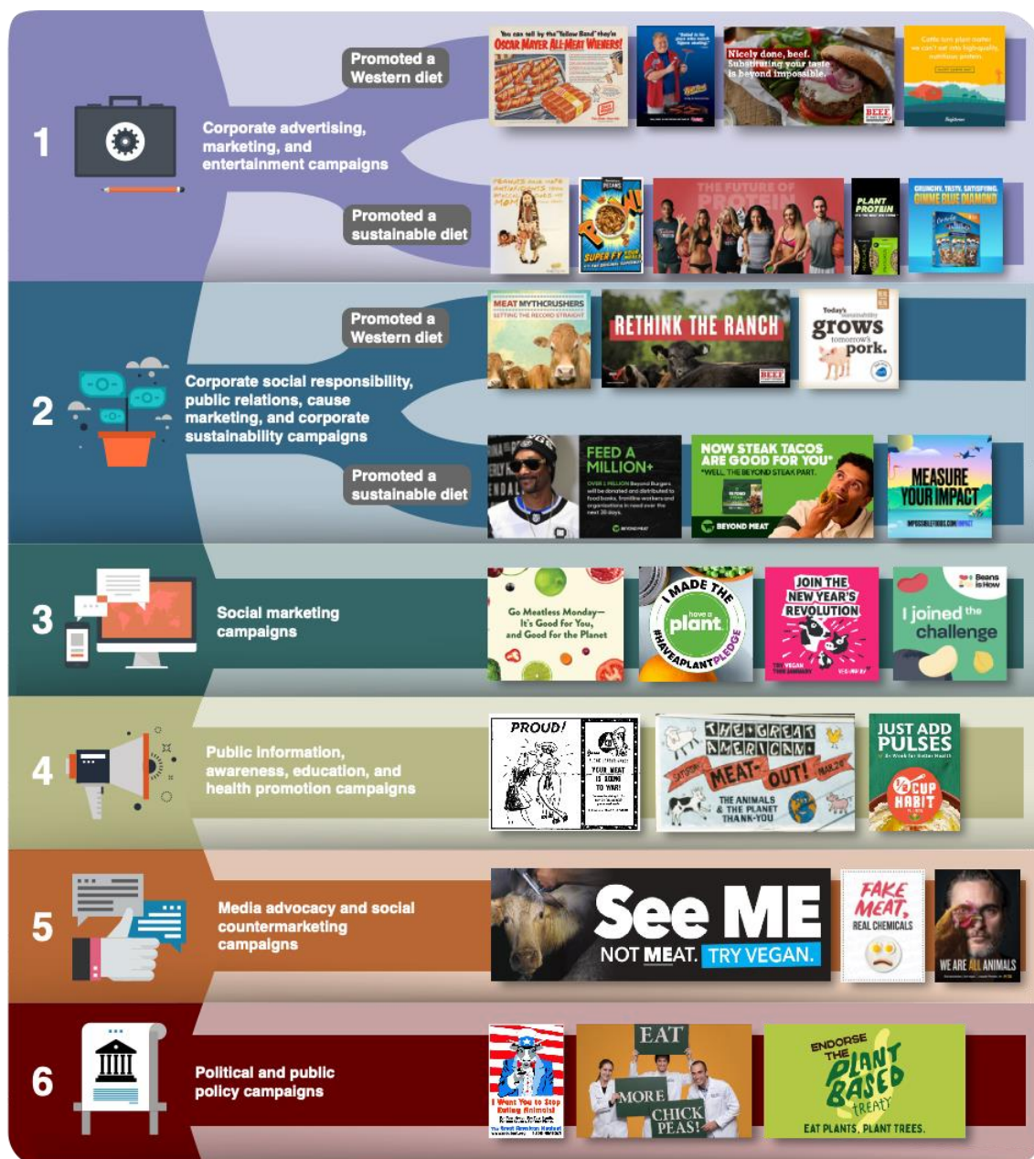
Figure 3. Illustrative images of media campaigns that promoted a Western or sustainable diet organized by typology category.

The RQ1 and RQ2 evidence identified a campaign landscape dominated by corporate advertising, marketing, and entertainment campaigns (58.6%; n = 51 ). The second most frequent campaign category was public information, awareness, education, and health promotion (13.8%; n = 12 ), followed by CSR, accountability, and corporate sustainability campaigns (12.6%; n = 11 ). Few media advocacy and countermarketing (5.7%; n = 5 ), social marketing (4.6%; n = 4 ), or political and public policy (4.6%; n = 4 ) campaigns were identified. Three campaigns fit into two separate campaign categories. The RQ1 and RQ2 findings for each of these campaign categories are described in detail in the following sections. Figure 3 provides an illustrative sample of media campaign images from each typology category. Figure S2 provides a fair use evaluation for the media campaign images allowed by the U.S. nominative fair use doctrine that protects the use of trademarked images for non-commercial educational or research purposes.