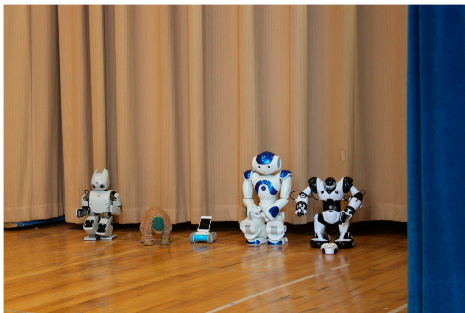
Figure 1. Robot theater program as part of an afterschool program at local elementary school. Children wrote the scenario, made props, and played live theater with robots.