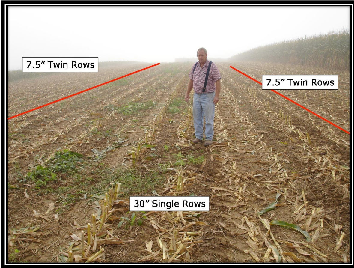
Figure 2. Typical effect of row spacing on weed control.