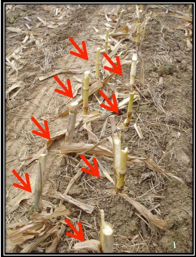
Figure 4. Precise plant placement achieved from the Great Plains GP1520 precision drill.