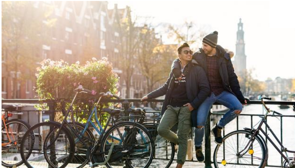
A couple enjoying Amsterdam, Netherlands.

The Human Rights Campaign has recently published its 2022 Corporate Equality Index , a national benchmarking tool that provides information on how corporations and businesses are doing to promote LGBTQ+ inclusion.