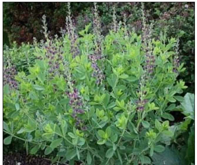
Baptisia Twilite Prairieblues™