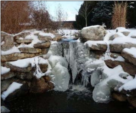
The Jane Andrews Memorial Stream Garden's icy waterfall

I must admit, the fast, harsh arrival of winter was really difficult for me this year. One moment I was raking leaves and planting bulbs, and then all of a sudden, the garden was frozen through and through and the unkind Blacksburg wind making any outside work totally miserable. I felt like a tropical annual hit by the first hard frost, brown and mushy, and totally incapable of surviving through the unforgiving winter to come. I existed in this brown, mushy state for near a few weeks before any sort of hardening-off occurred. Now, after the craziness of the holidays, more snow, and constant blistering wind, I am starting to feel prepared to deal with what Mother Nature has to offer these next few months. And what's even more, I am enjoying it!