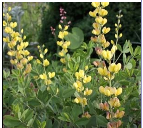
Above and right: Baptisia 'Solar Flare' in the author's garden