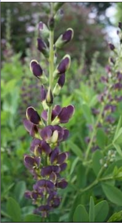
Baptisia Twilite Prairieblues™ in the Hahn Horticulture Garden

Baptisia Twilite Prairieblues™ (botanical name is Baptisia × variicolor 'Twilite' PPAF) is a cross between B. australis (our PPA winner) and B. sphaerocarpa - a shrubby, tough little guy with yellow flowers. This fortuitous romance yielded quite a jaw-dropping color combination of dusky violet with a yellow keel petal. Look for them in the Hahn Horticulture Garden along the paved path near the xeriphytic border . Last year's bloom time was mid-May through the beginning of June.