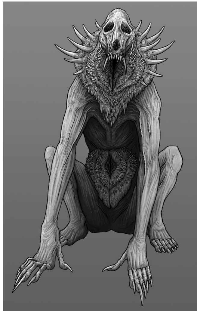
Figure 6. Concept art of the Devoratus.

These questions led to the game being split into two parts: the exploration phase and the scenario phase. Once at least three Cultus Clue tokens have been placed and at least 30 game tiles are on the board, the exploration phase will end when the scenario phase is triggered. This means that the characters have encountered multiple areas of significance and have been exposed to enough anomalies so that one of them is about to turn into a monster. With heavy influence from body horror, the chosen player will metamorphose for a couple turns in a cocoon before emerging as a monster. At this point, the players are pitted against