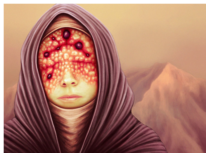
Figure 9. Illustration for the event “A Chance Encounter.”

recognizable as some sort of animal, but it is so disfigured and abnormal that it may bring unease and mental confusion. In the illustration for “A Chance Encounter,” a cloaked humanoid figure is shown (see figure 9). There are clearly human features on this being’s face, but the abnormal attributes overpower them. This looks like