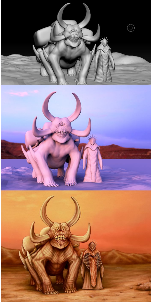
Figure 11. The process of creating the illustration for the event “A Wanderer.”

process is like sculpting on a two-dimensional plane in a way, as it begins with loose, basic forms emerging from the darkness and slowly evolves to take on more detail as the painting is completed.