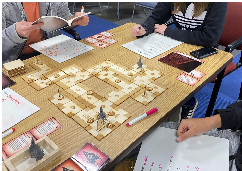
Figure 2. The game board being built up during the exploration phase.

There are multiple tokens that may be placed on the tiles as players experience the game. Each player has their own unique character