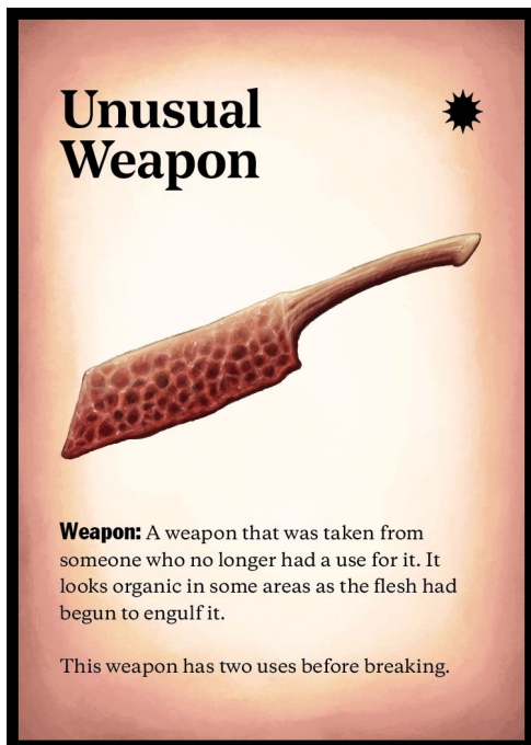
Figure 5. The card design for the item "Unusual Weapon."

Item cards are what represent an item that a character may find in the game (see figure 5). Item cards are separated into three different categories: weapons, distractions, and valuables. Weapons and distractions may be used in certain event situations for offense or defense, while valuables may be traded or may become useful in certain events and the scenario phase of the