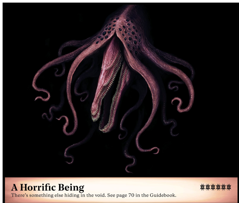
Figure 4. The card design for the event "A Horrific Being."