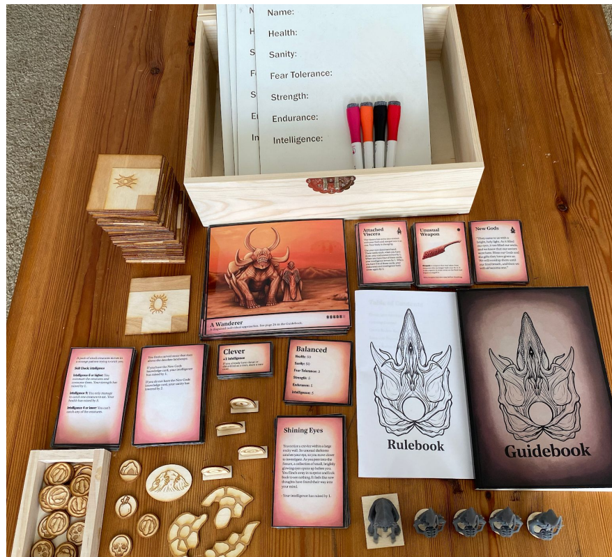
Figure 1. All of the components of the game.