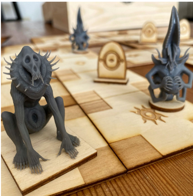
Figure 3. The Devoratus token (left) and the Cultus Clue token (right) are identified by 3D printed models.

While the tokens that are left on tiles may change how players interact with that tile, these tokens may also have different uses once the exploration phase ends and the scenario phase begins. For example, Viscera tokens do not have any effect during the exploration phase, however, when the scenario has begun, they are useful to both the humans and the monster. The monster may seek out the Viscera tokens to consume the Viscera found at that tile in order to