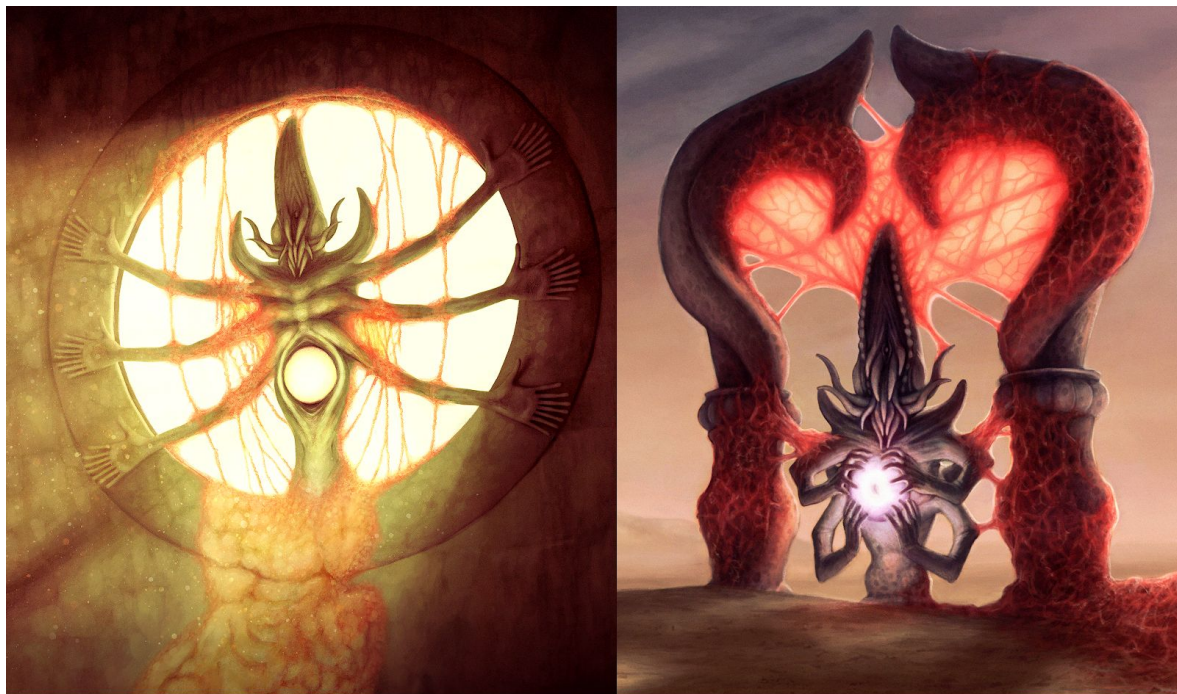
Figure 13. Illustrations for the events “An Infected Church” and “A Lone Shrine” show similar sculptures with glowing orbs in their possession.

events “A Lone Shrine” and “An Infected Church” (see figure 13). All of these show imagery of the First Messengers. These common visual elements in the world aim to help the players contemplate what this figure could be and what its importance is to the game world. By using the repeated imagery of these figures and their glowing orbs, the goal is to convince the players that