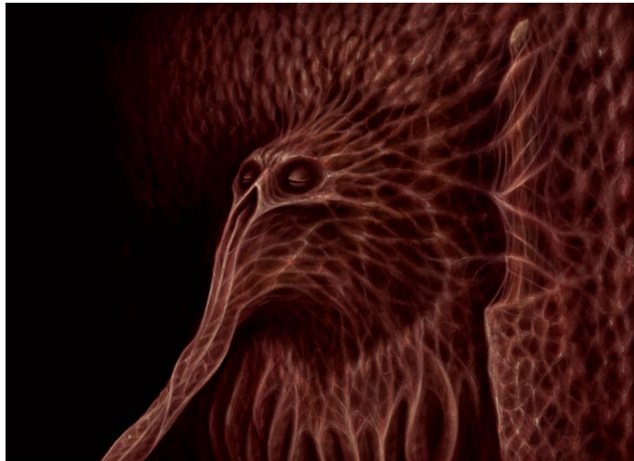
Figure 10. Illustration for the event “Remains of Another.”

Each of the event illustrations is a digital painting, but the process in which these paintings were created varies. Many of the illustration processes used were experimental as different ways of