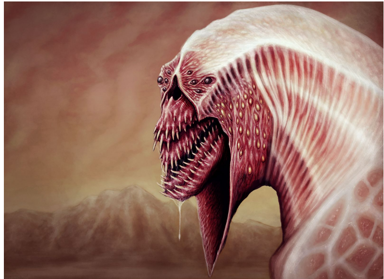
Figure 8. Illustration for the event “An Ambush.”

category jamming while the overall atmosphere of the illustration is meant to depict a strange, otherworldly setting that can allow a mood of horror to grow. In the illustration for the event “An Ambush,” a dog-like creature has found the character (see figure 8). This beast stares with multiple beady eyes and drools from an excessive mouth. It has an overall form that makes it