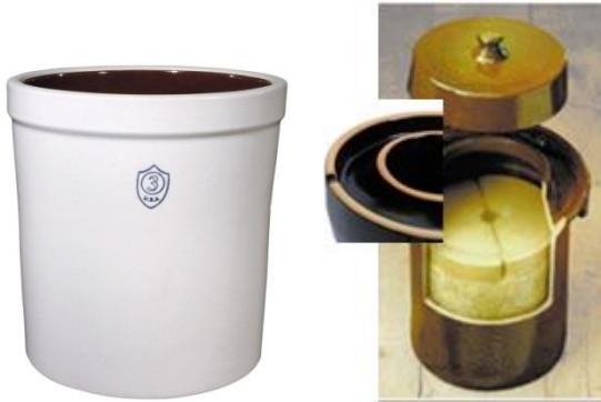
Figure 2. Examples of a simple cylindrical ceramic crock (left) and a specialized fermentation crock (right).

removed or disrupted which may be difficult for curious cooks.