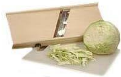
Figure 6. Kraut Cutter or Kraut Board