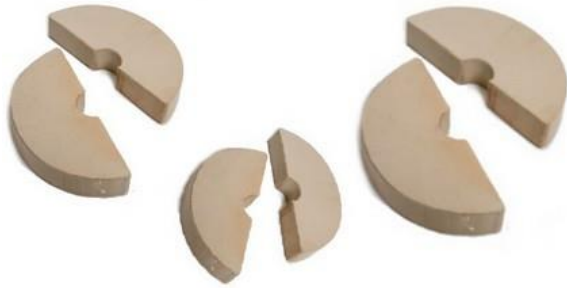
Figure 3. Ceramic Fermentation Weights

weights that are not intended for food use as they may contain harmful compounds such as lead. Rocks should never be used as weights because they may contain heavy metals and limestone that can degrade under salty and acidic environments and can become part of the food.