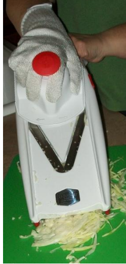
Figure 5. Mandolin. User is wearing a cut resistant glove.