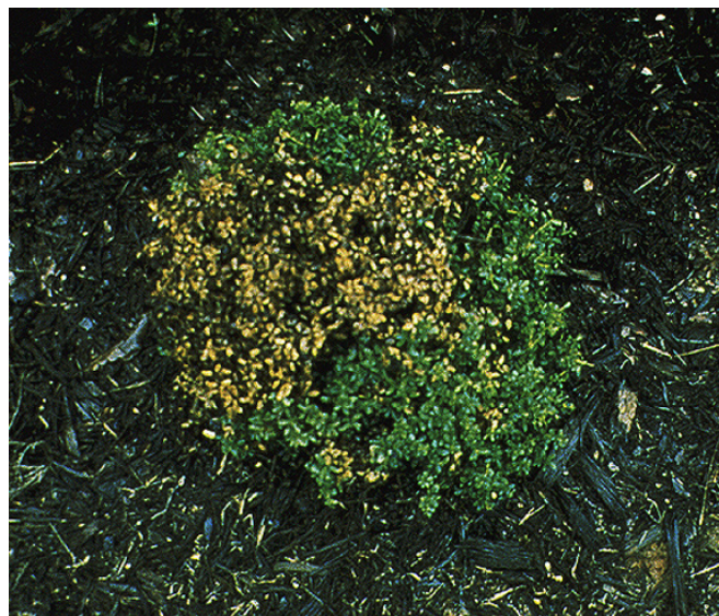
Fig. 2. Foliar dieback on Japanese holly cv. 'Helleri' due to black root rot.

The disease is named for the black lesions that commonly occur on infected feeder roots (Fig. 1.). Symptoms on Japanese holly include foliar chlorosis, leaf drop, and stunting. Although stems and leaves are not colonized by the fungus, plants suffer a gradual dieback as a result of root death (Fig. 2.). Young holly plants in the nursery can be killed within weeks as a result of severe root destruction by the fungus; however, mature plants decline more slowly. Thielaviopsis basicola produces reproductive structures, called conidia, and survival structures, called chlamydospores, on infected roots (Fig. 3.). The chlamydospores can survive in the soil for long periods of time in the absence of a host plant.