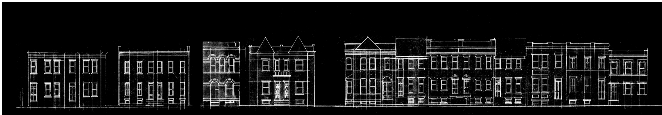
EAST FACADES OF COLUMBUS STREET ACROSS FROM PROJECT SITE CONTEXTUAL SKETCH

The following spectrum of modes are explored within the context of this site: personal identity, personalization, personal, privacy, private, semi-private, semi-public, public, social, communal, communal identity, community.