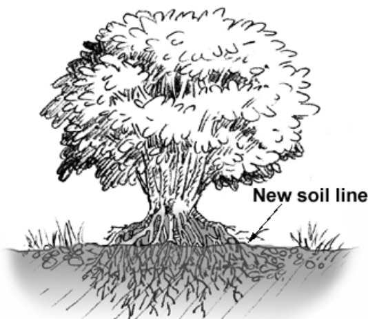
Frost heaving is most common in small, new plantings. The danger is root exposure. Replant quickly.

Although it is unattractive, small evergreens can be protected by using windbreaks made out of burlap, canvas, or similar materials. Windbreaks will help reduce the force of the wind and shade the plants. They can be created by attaching materials to a frame around a plant. A complete wrapping of straw or burlap is sometimes used. Black plastic should be avoided as a material for wrapping plants. During the day heat builds up inside, increasing the extreme fluctuation between day and night temperatures and speeding up growth of buds in the spring, making them more susceptible to a late frost. If plants require annual protection measures to this extent, move them to a more protected location or replace them with hardier specimens.