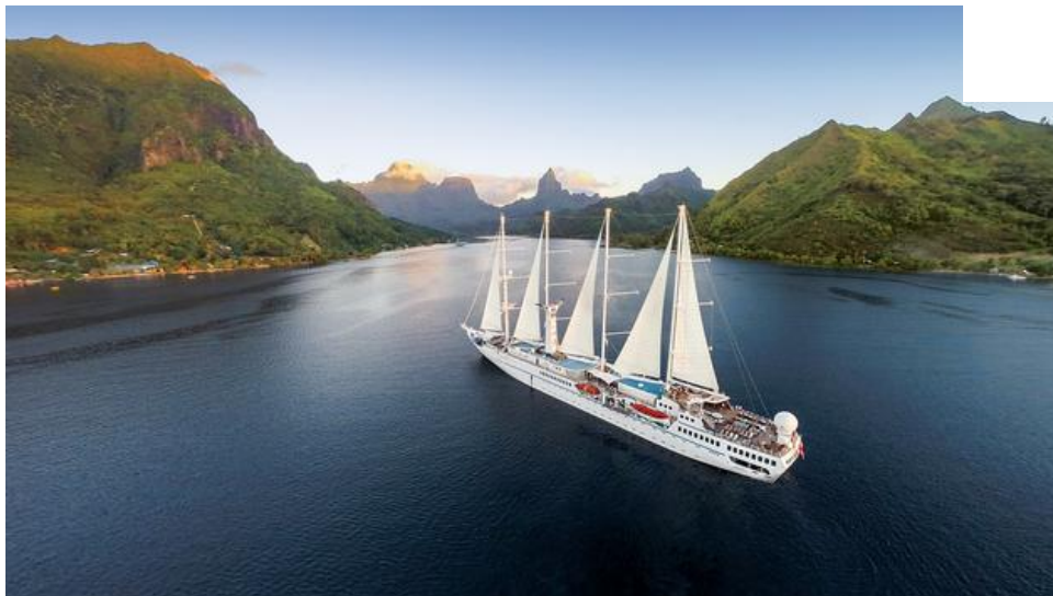
Windstar's Wind Spirit in Tahiti

The International LGBTQ+ Travel Association found that 73 percent of the LGBTQ community surveyed across the globe planned to take a major vacation before the end of this year.