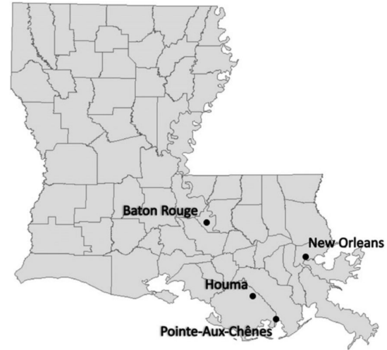
Figure 1. Pointe-Aux-Chênes, Louisiana