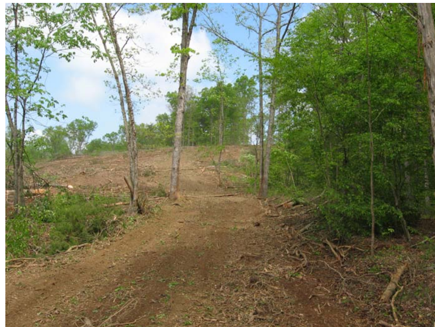
Figure A26. Left approach of pole bridge during harvest.