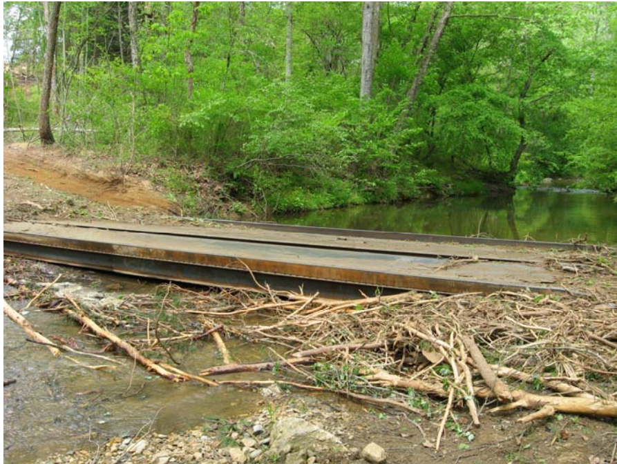
Figure A43. Largest steel bridge crossing used for study.