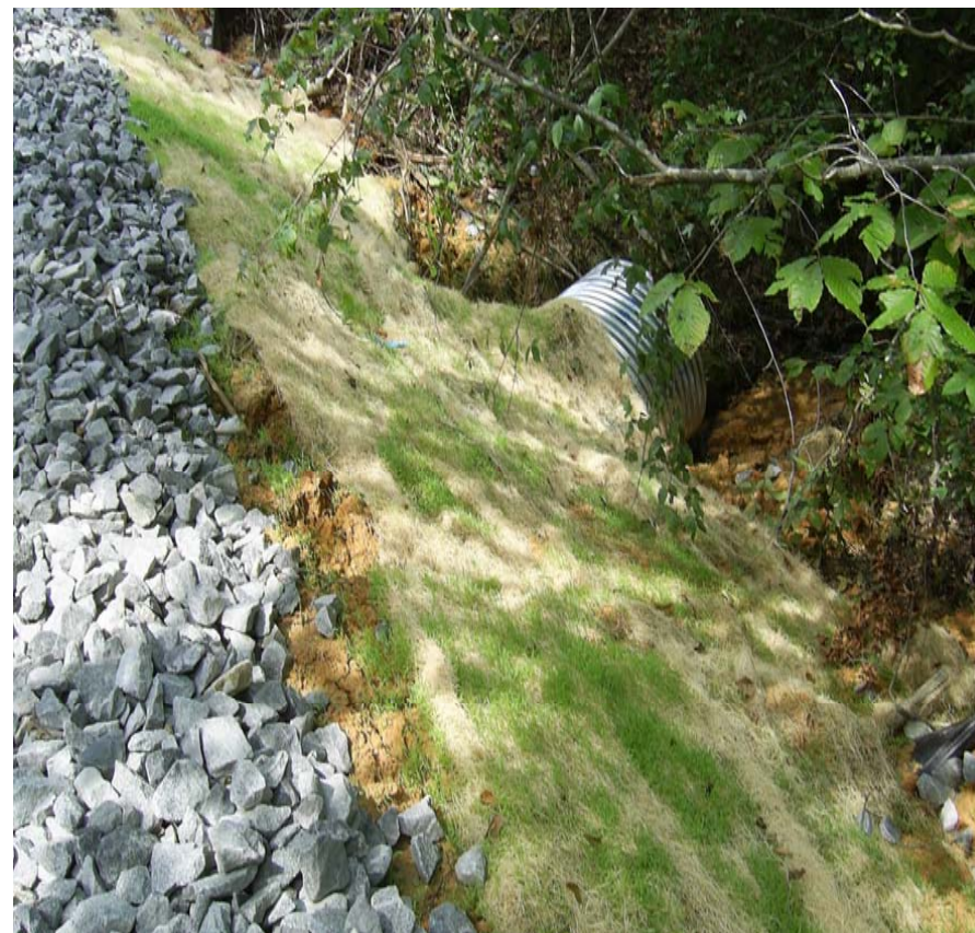
Figure A4. Curl-Ex material and rock used during harvest