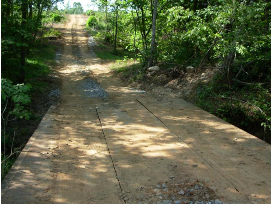
Figure A39. Steel bridge crossing and approach.