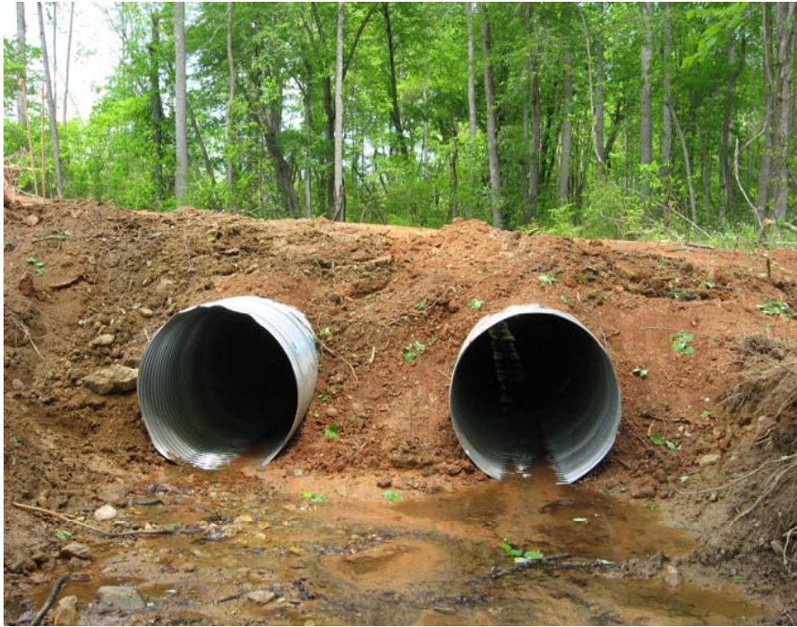
Figure A7. 48-inch culvert pipes installed in Pittsylvania Co.