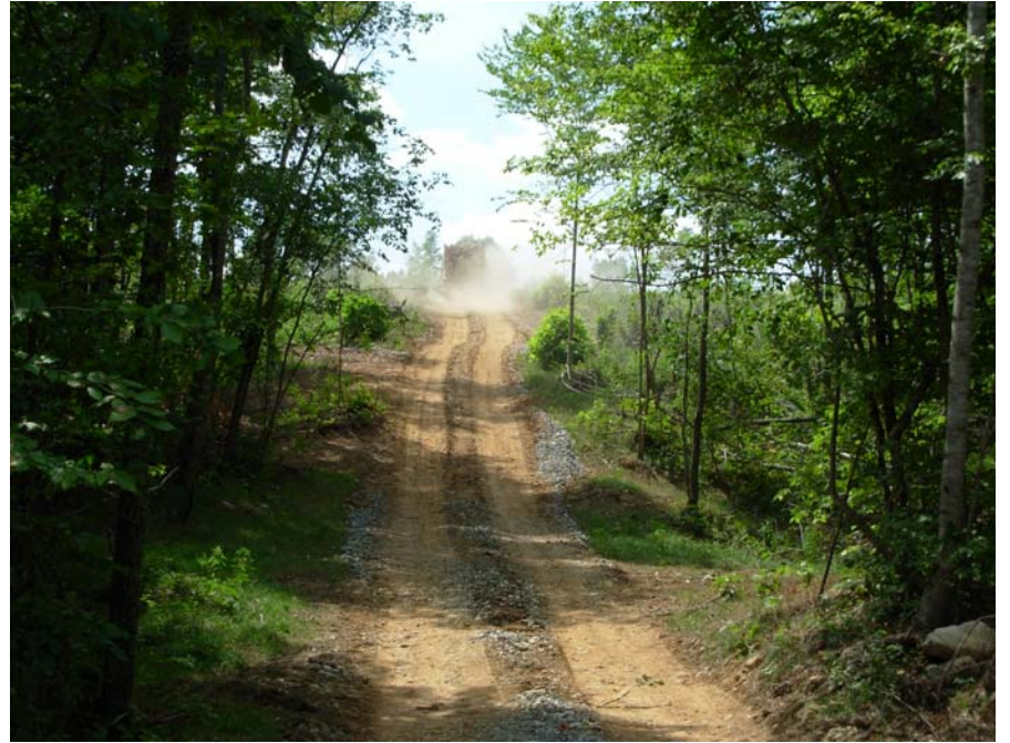
Figure A40. Left approach to steel bridge crossing.