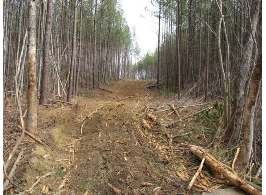
Figure A42. Left approach to stream crossing.