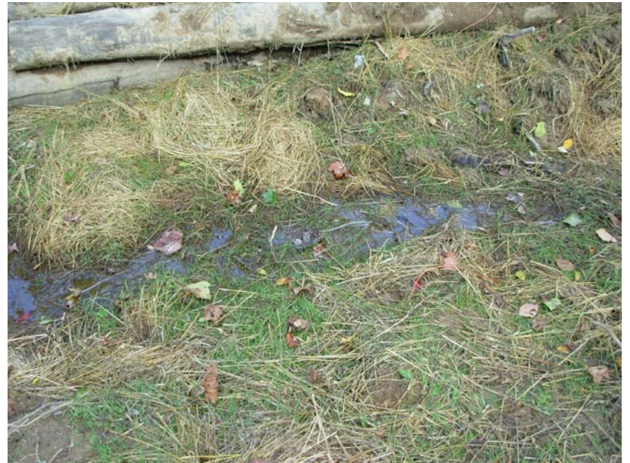
Figure A32. Ephemeral stream after pole bridge removal.