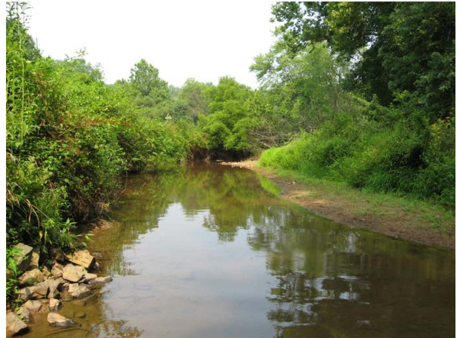
Figure A20. Photo of Thumb Run upstream from ford.