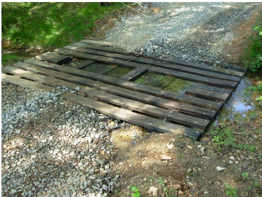
Figure A15. Re-enforced ford with logging mat during use.