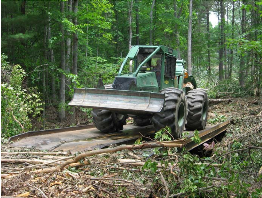
Figure A45. Steel bridge during skidding operations.