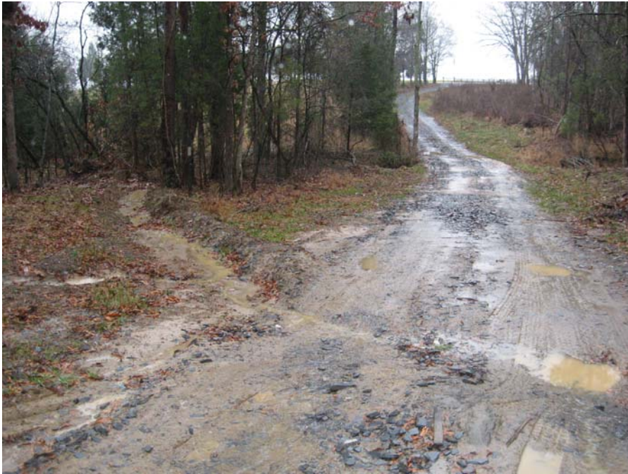
Figure A9. Culvert crossing with water control structures.