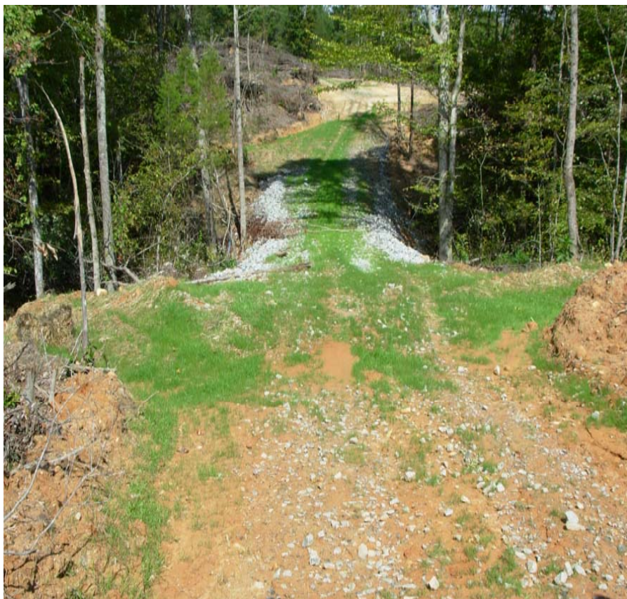
Figure A3. Culvert crossing and left approach after harvest.