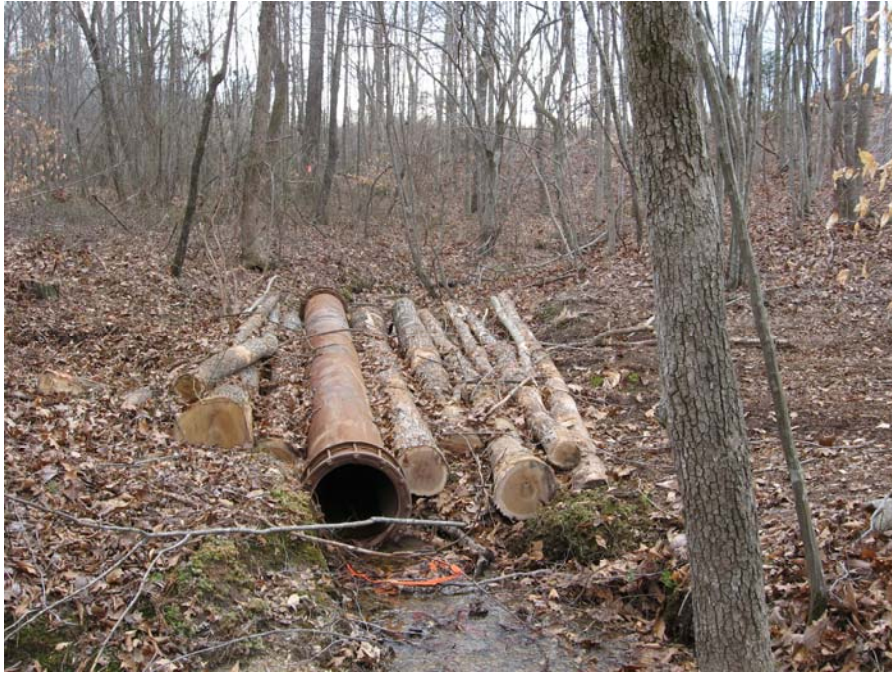
Figure A21. Pole bridge crossing after installation.