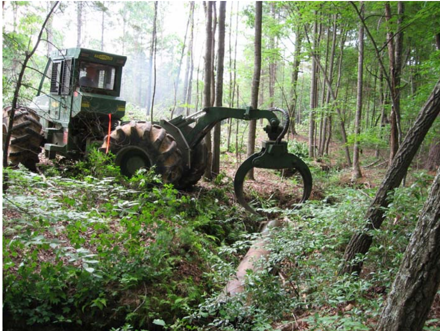
Figure A33. Pipe installation of pole bridge crossing.