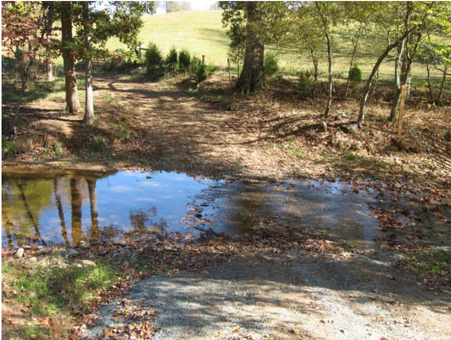
Figure A17. Ford stream crossing on Bremono Creek (Fluvanna Co).