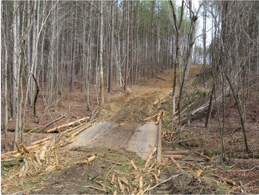
Figure A41. Steel bridge stream crossing during use.