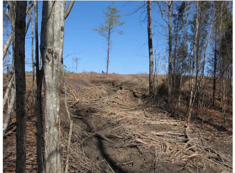
Figure A36. Right approach to steel bridge crossing.