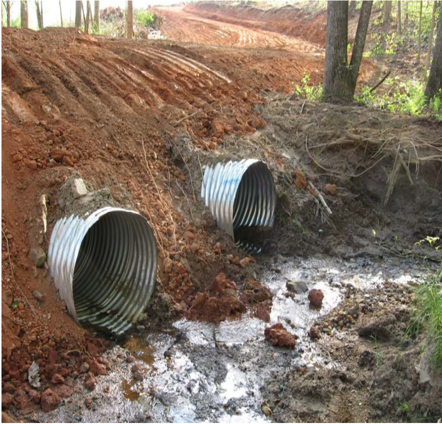
Figure A5. Double corrugated culvert pipes.