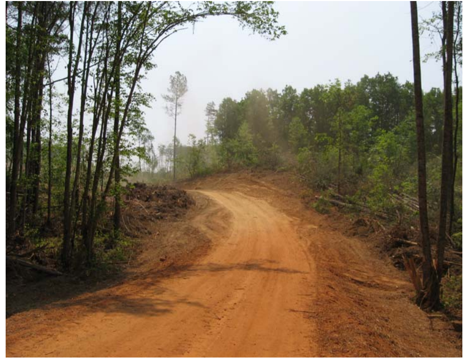
Figure A8. Right approach of culvert crossing.