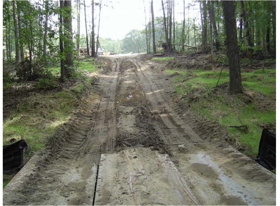
Figure A38. Left approach to steel bridge crossing.