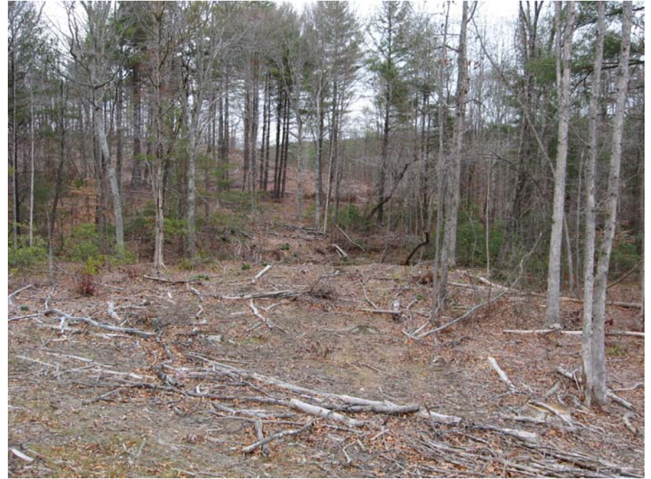
Figure A46. Steel bridge approaches after road closure.