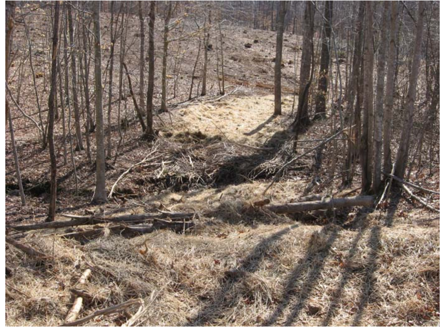
Figure A22. Pole bridge approaches after road closure.