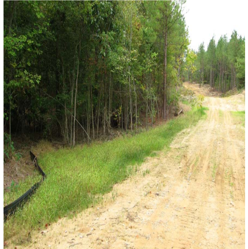
Figure A2. Culvert crossing with a variety of BMPs.