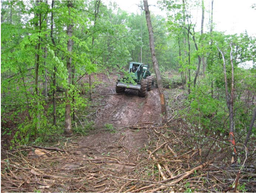
Figure A29. Pole bridge crossing during use.