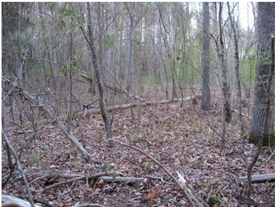
Figure A25. Left approach of pole bridge before installation.