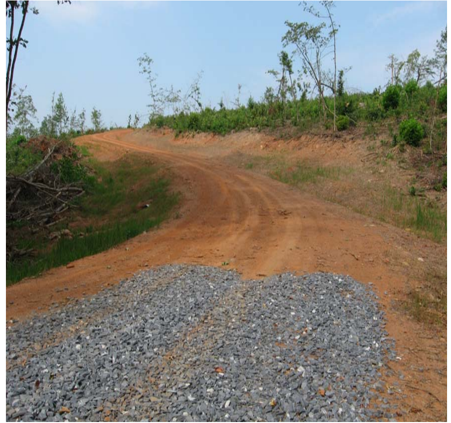
Figure A6. Partial gravel application on left approach.