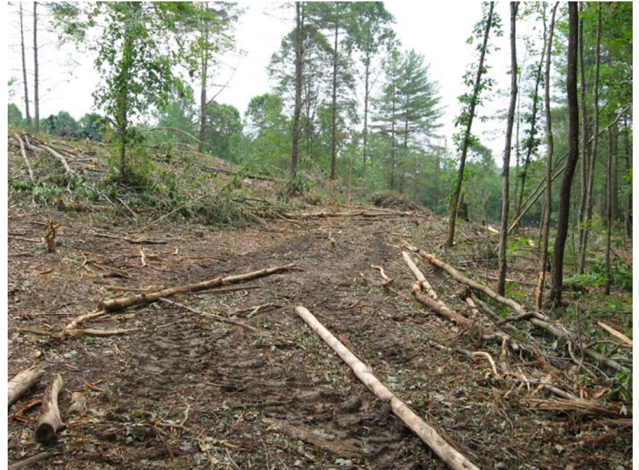
Figure A34. Right approach to pole bridge during use.