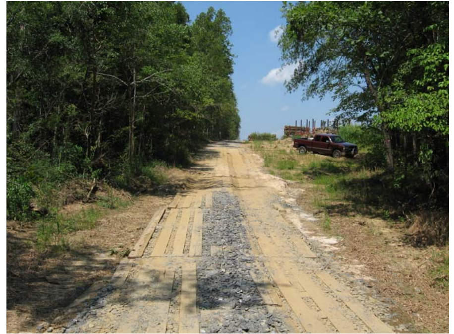
Figure A10. Right approach during harvest to crossing.