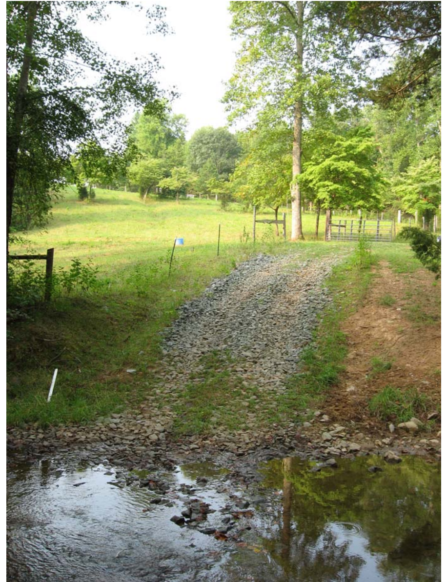
Figure A18. Left approach with a 20% grade.