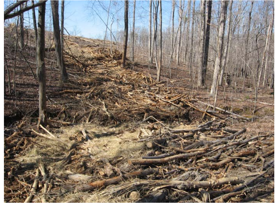
Figure A24. Pole bridge crossing after road closure.