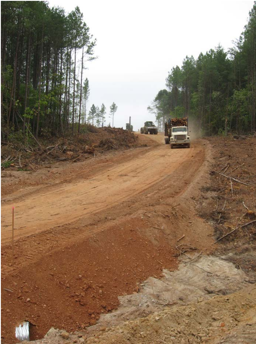
Figure A11. Culvert crossing during harvest.