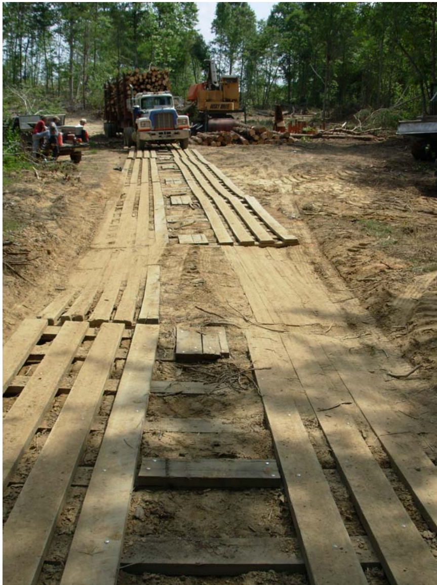
Figure A31. Right approach to pole bridge during use.