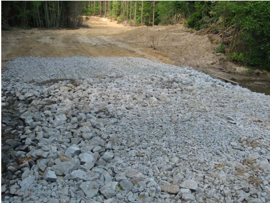
Figure A13. Re-enforced ford stream crossing in Amelia Co.