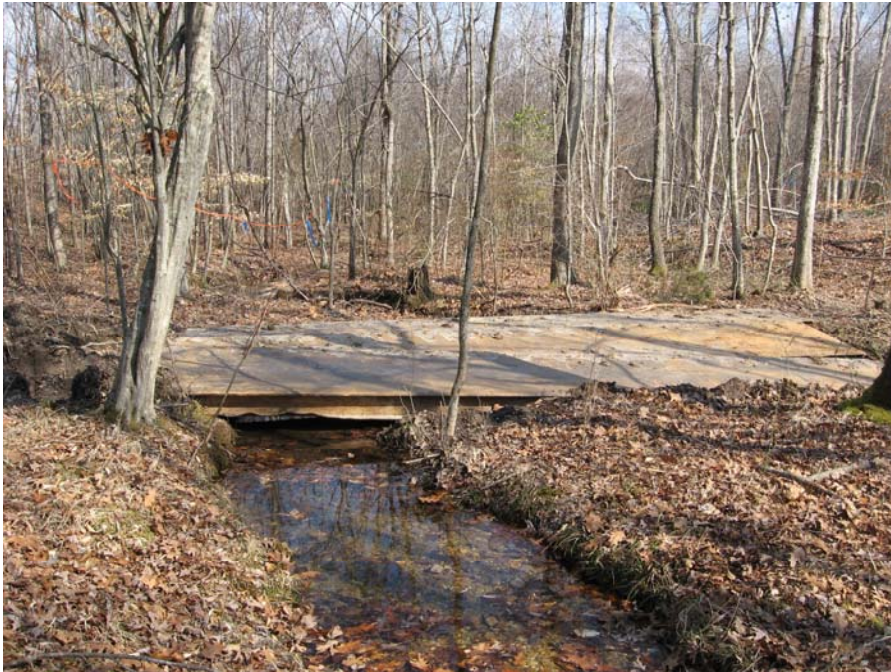
Figure A35. Steel bridge crossing installed before harvest.