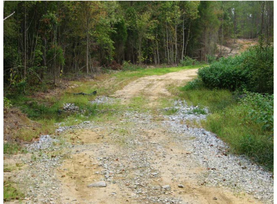
Figure A14. Ford crossing from left approach after harvest.