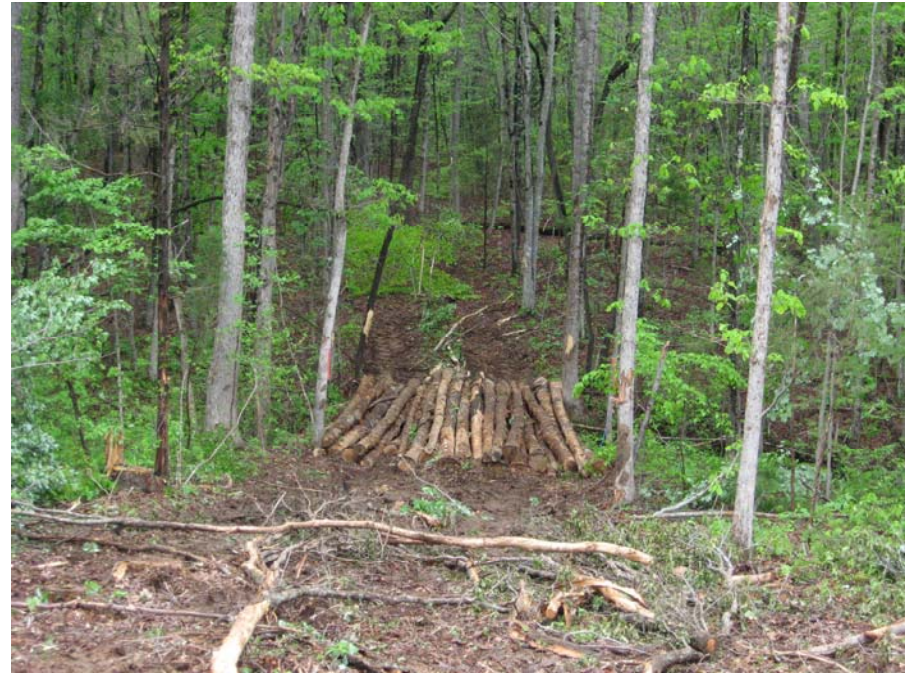
Figure A28. Left approach to pole bridge crossing.