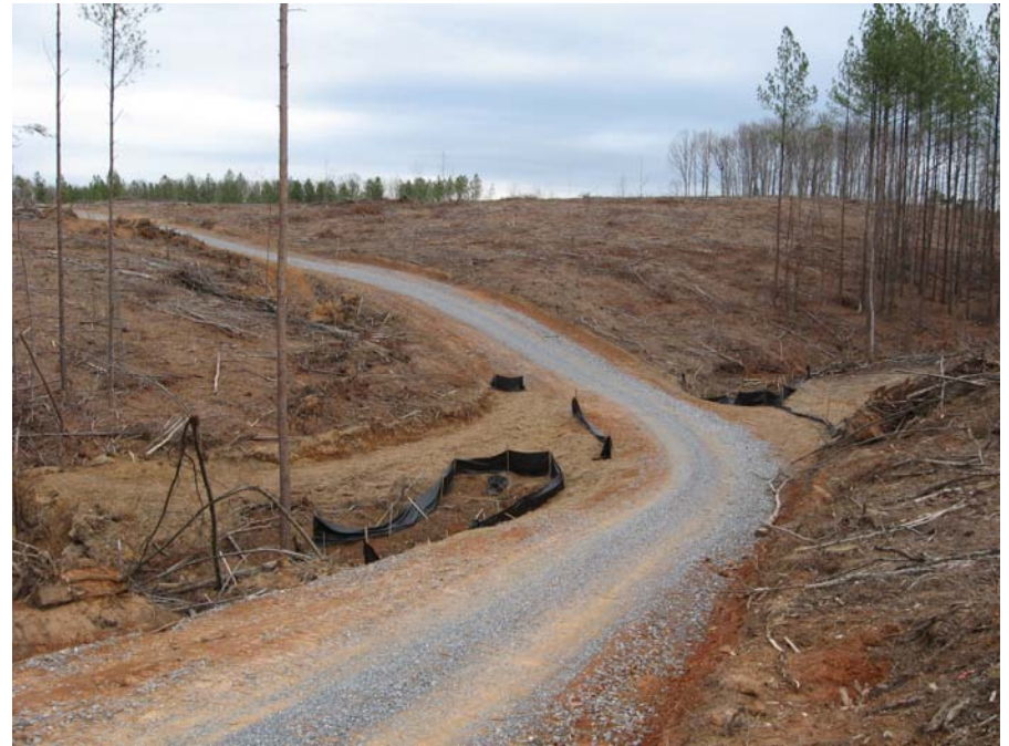
Figure A12. BMPs after harvest; gravel, seed, and silt fence.