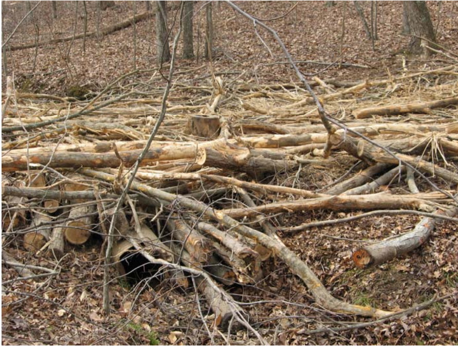
Figure A23. Pole bridge crossing in an intermittent stream.