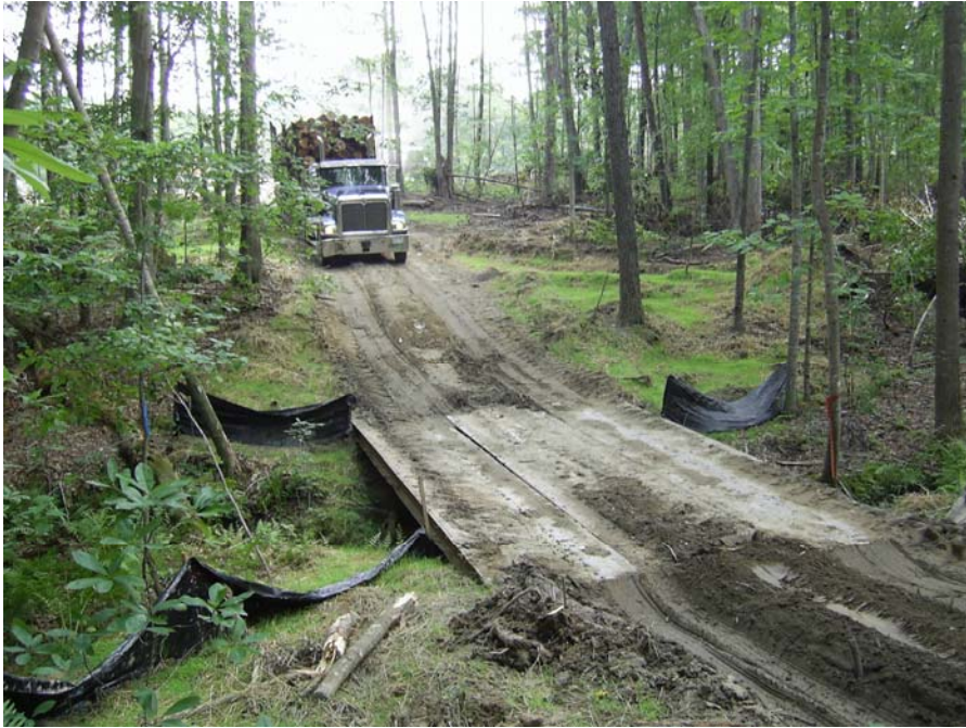
Figure A37. Steel bridge crossing during log truck use.