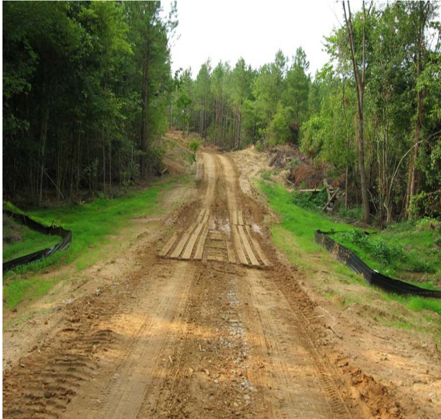
Figure A1. Purcell culvert crossing during harvest.