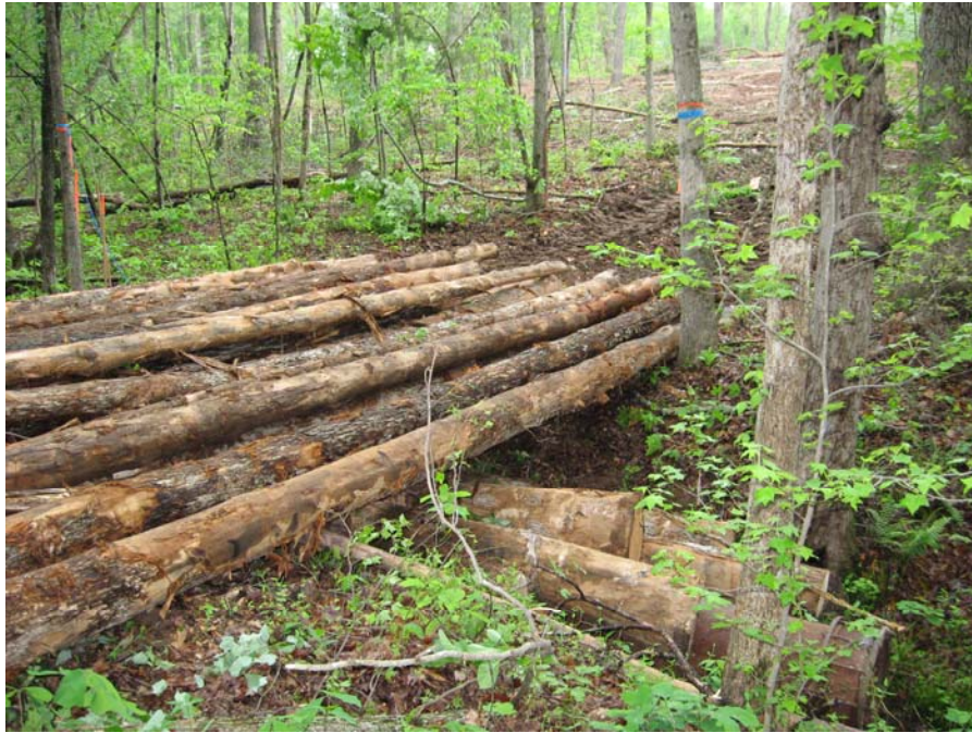
Figure A27. Unique pole bridge in Charlotte Co.