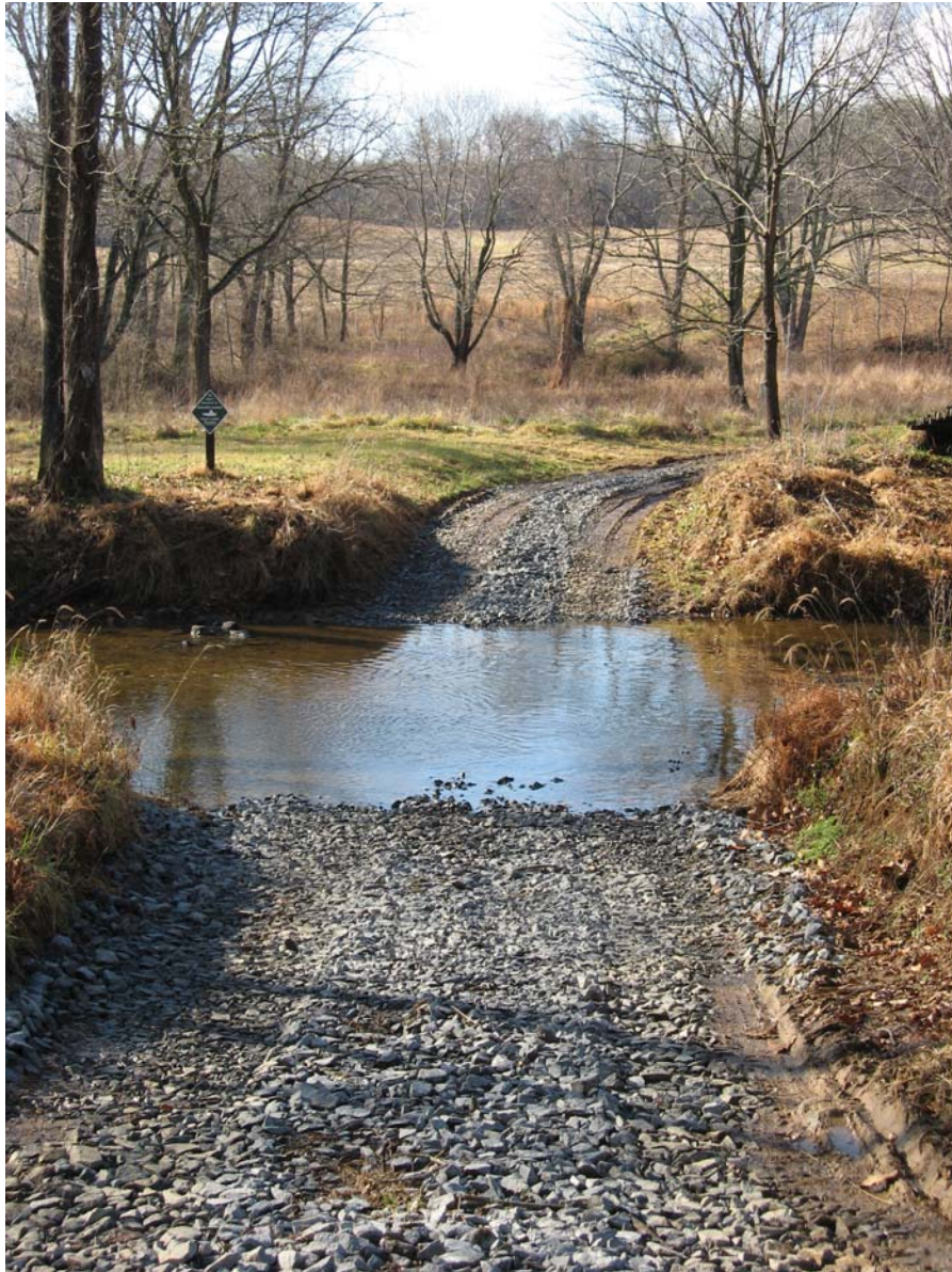
Figure A19. Ford crossing on Thumb Run (Fauquier Co.)