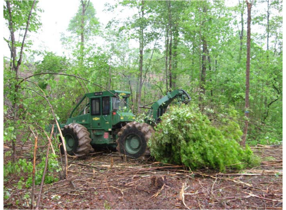
Figure A30. Application of slash to approaches during use.