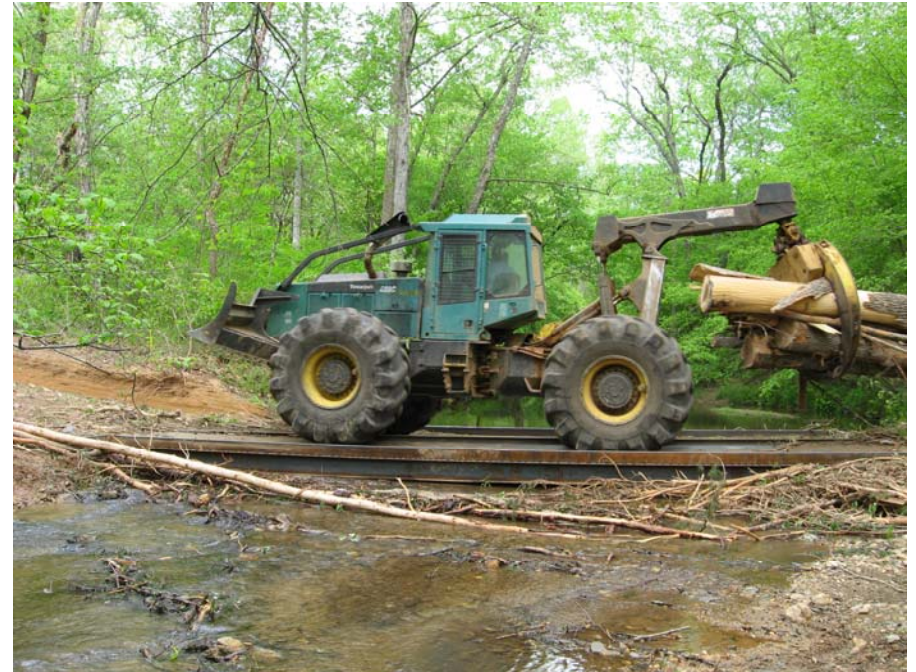
Figure A44. Steel bridge during skidder use.