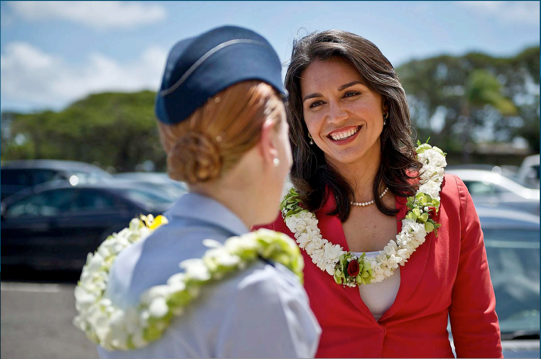
U.S. Rep. Tulsi Gabbard, right, speaks to an Airman -March 29, 2013