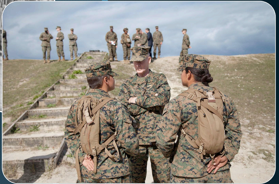
Infantry Training Battalion Nov 2013