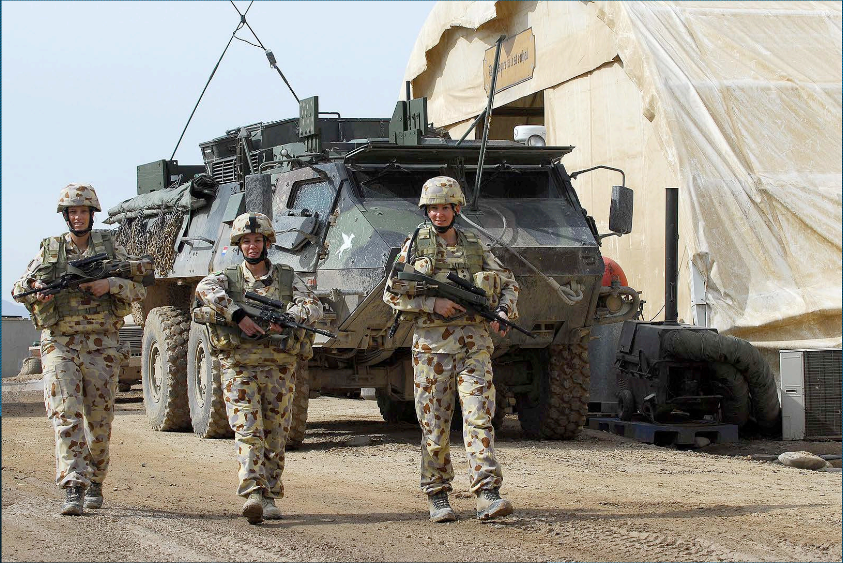
SAF Headquarters Public Affairs Office from Kabul, Afghanistan