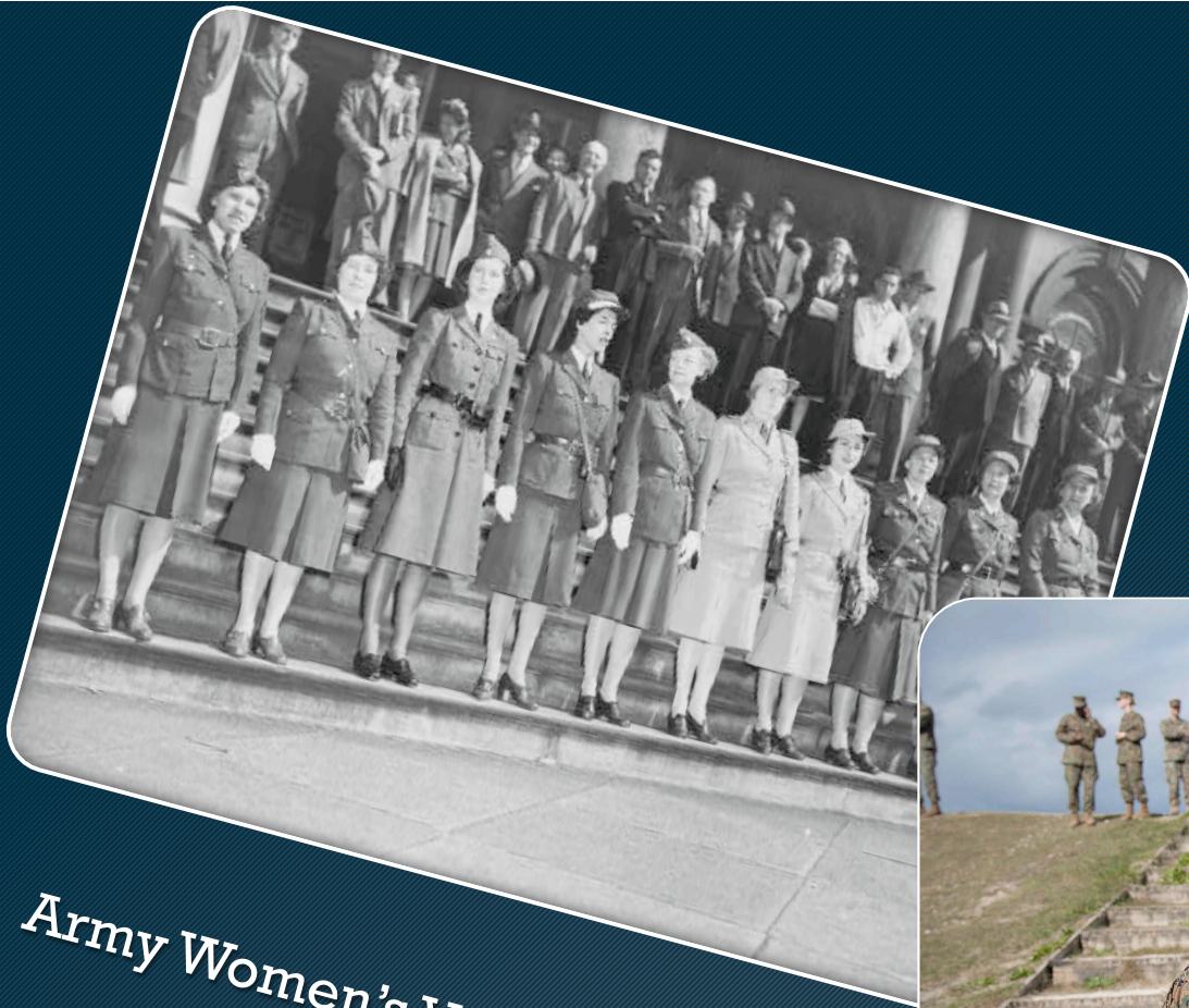
Army Women's Voluntary Service 1952