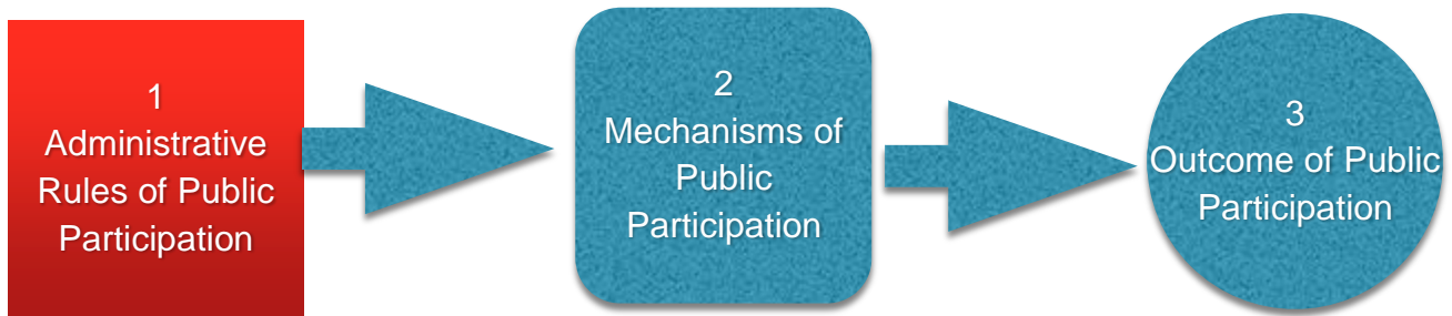
Figure 1: Public Participation Process

public participation. In addition, practitioners can learn lessons from how those perceptions changed from negative (unsuccessful) to positive (successful) public participation.