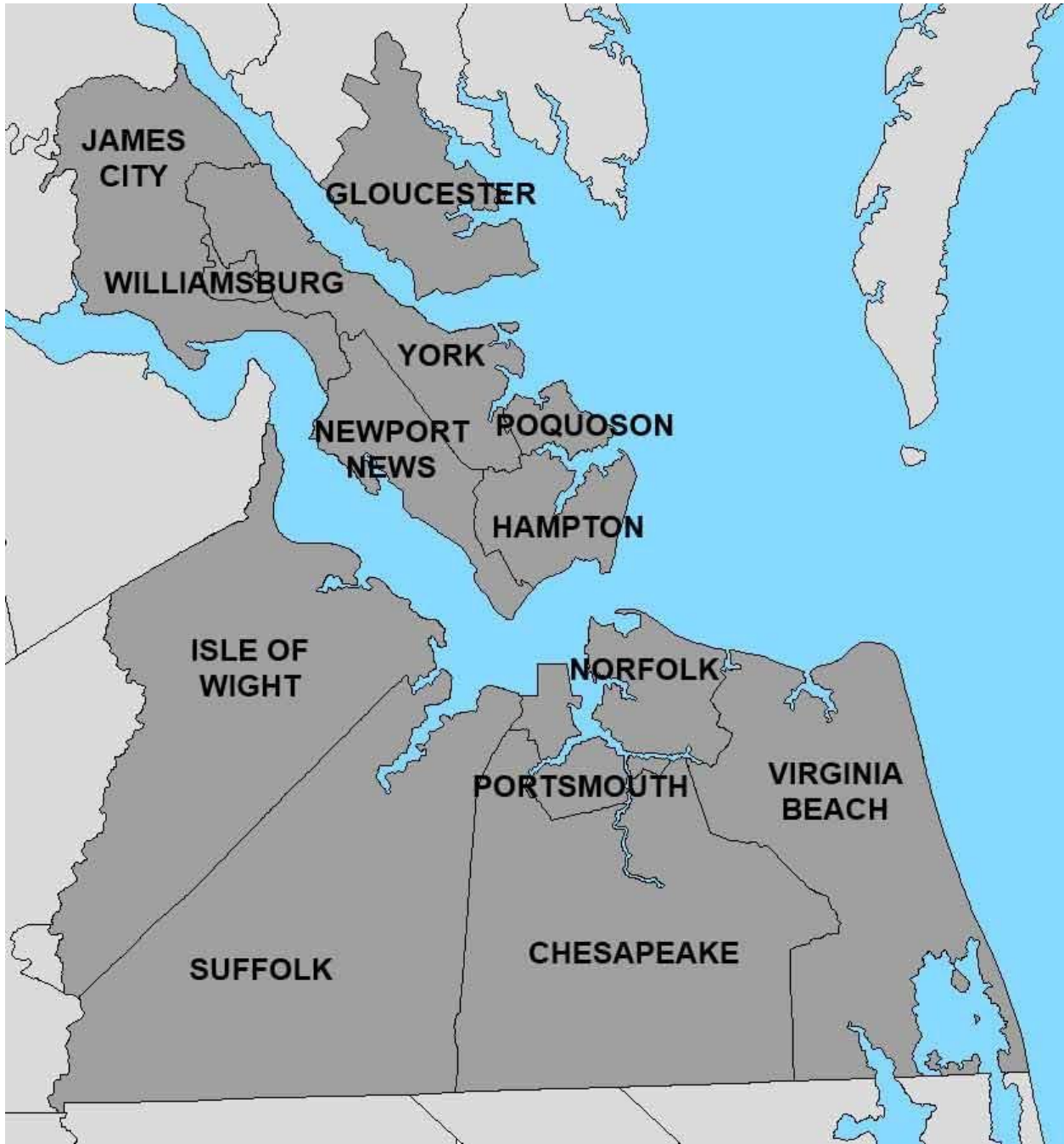
Figure 2: HRTPO Jurisdictional Boundaries