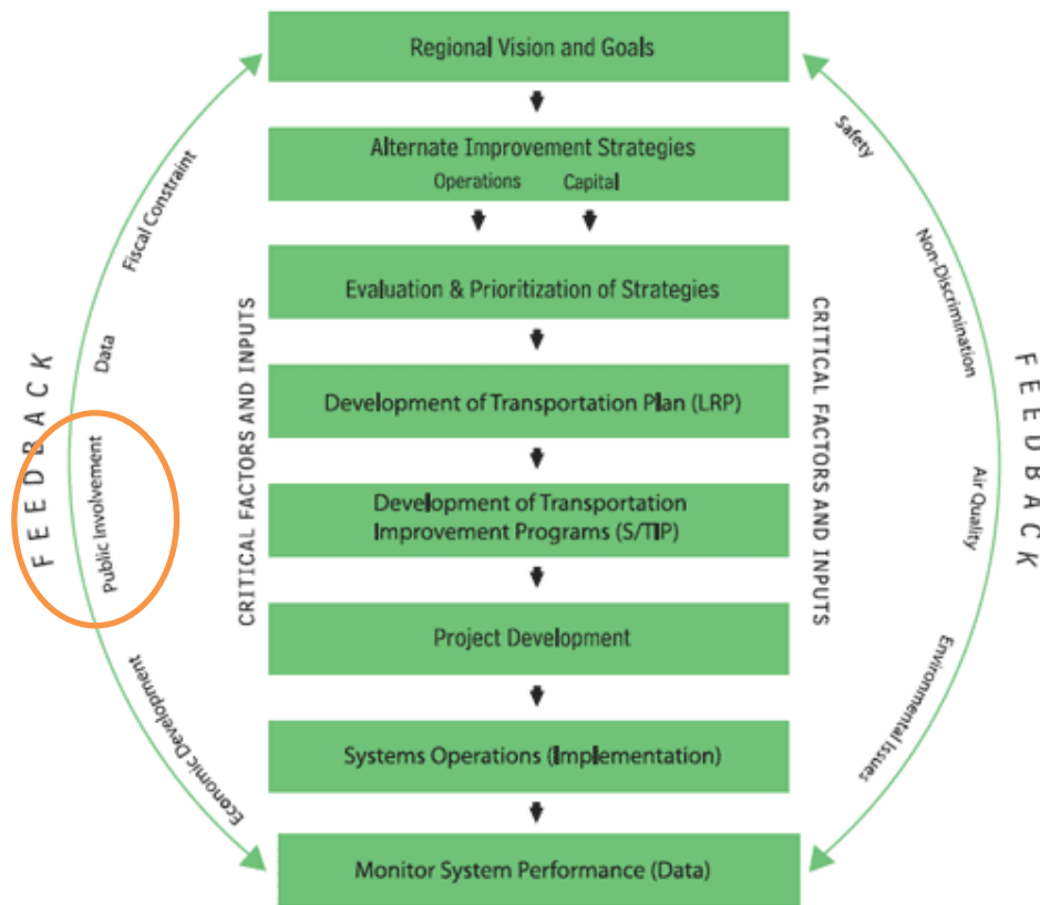
Figure 3: Transportation Planning Process (FHWA/FTA 2007, 2).