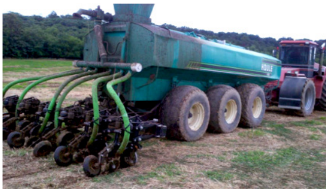
Figure 2. The 6,300 gallon tanker fitted with Dawn® injectors that was used in the economic assessment in the Shenandoah Valley.

If the spreading window is large enough, injection can be done without the nurse unit. But typically, especially for custom operators, the fewer acres per hour are not acceptable because weather and other issues limit the available time to spread. A shorter distance would have made the nurse truck unnecessary, while a greater distance would have made it more important.