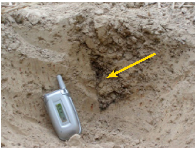
Figure 3. Photograph of injection slit at the end of the growing season following corn harvest. Cell phone is for scale, and arrow points to manure injection slit rich in organic matter.